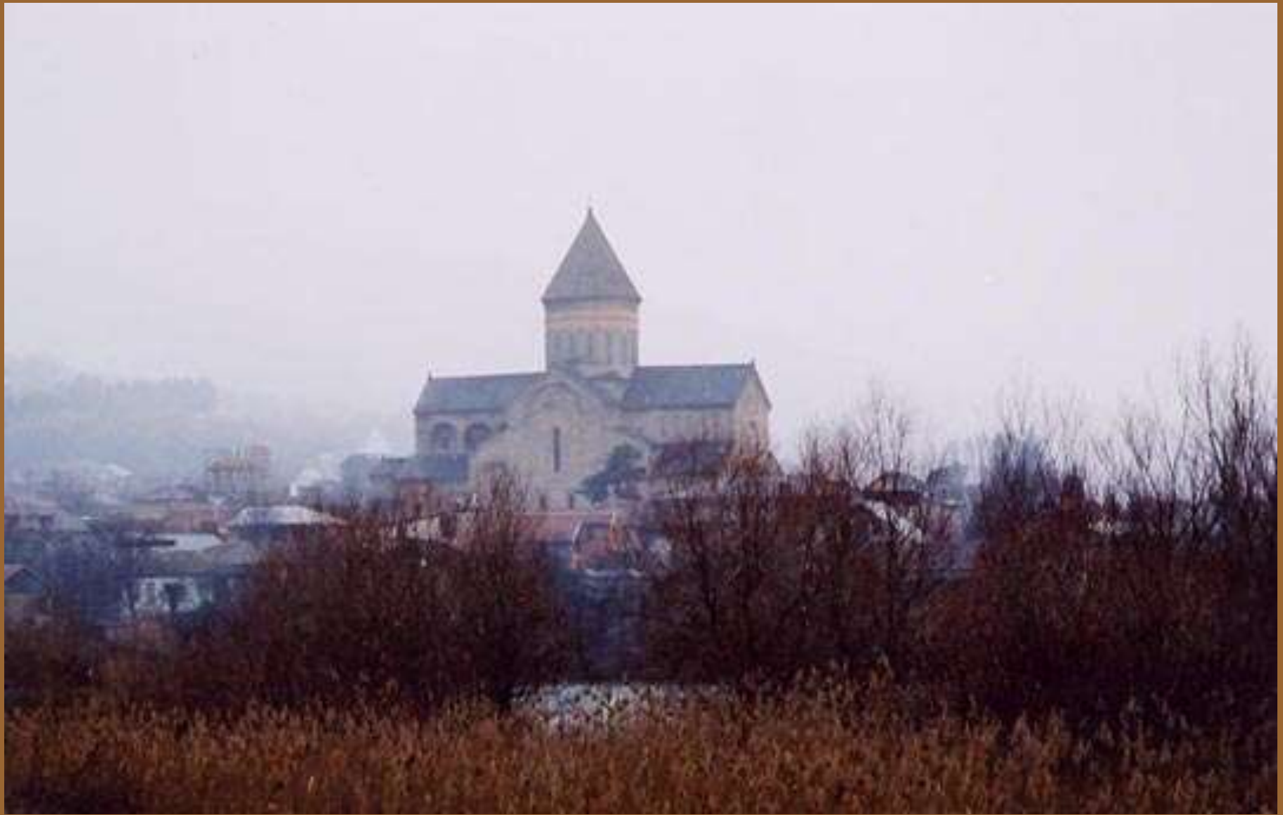
Svetitskhoveli Cathedral (12 th Century) in Mtskheta, the Old Capital of Georgia