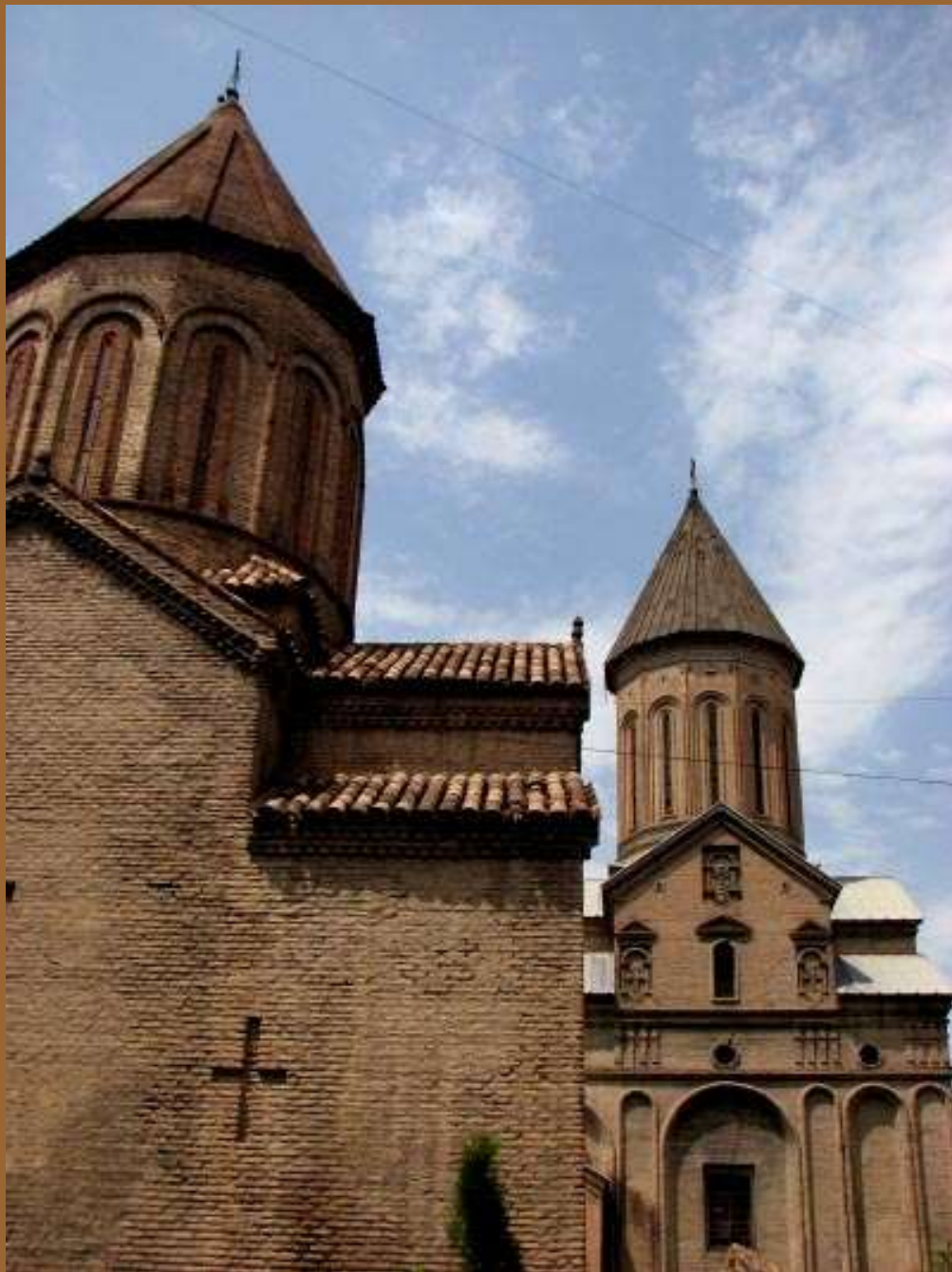
Churches in Old Tbilisi