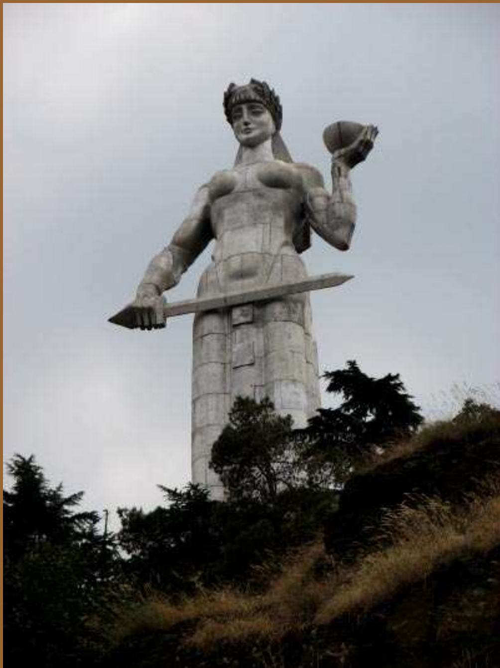
“Mother Georgia” Monument