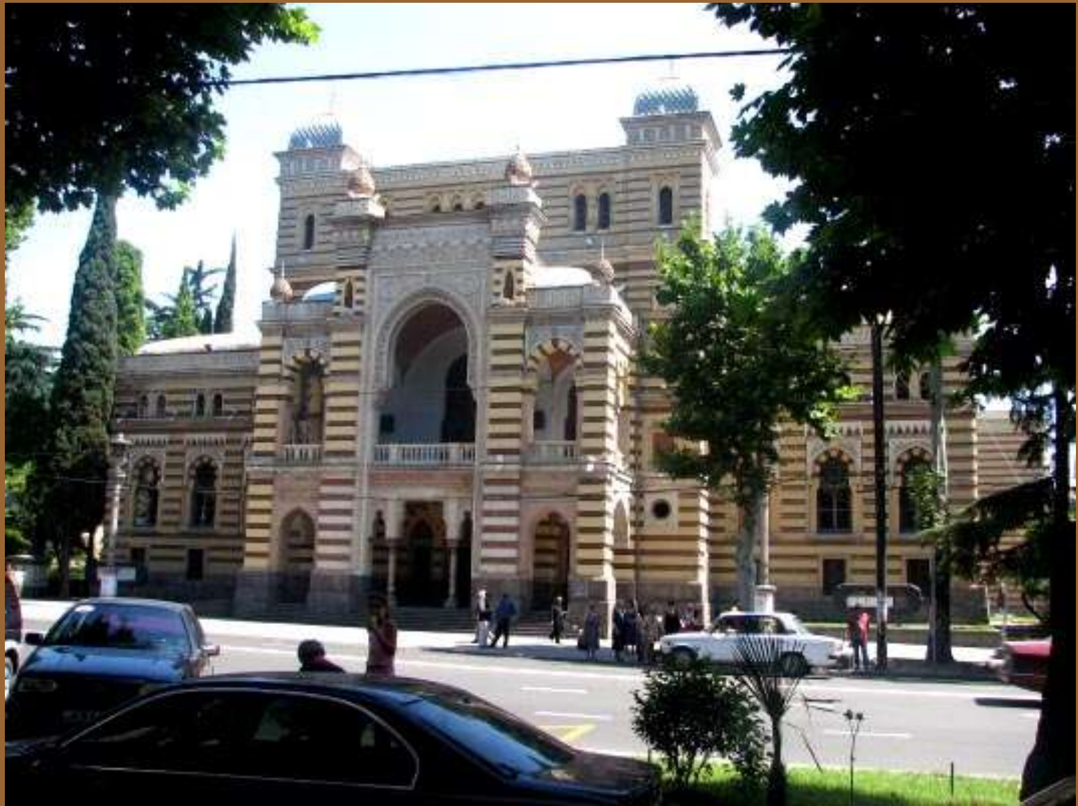
Tbilisi Opera House Built in 1878