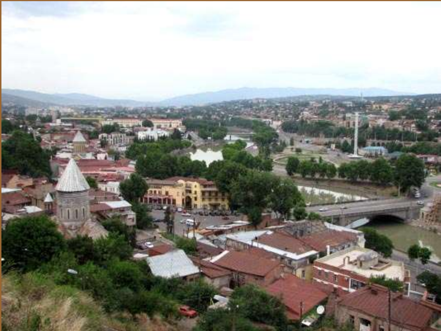
View of Old Tbilisi