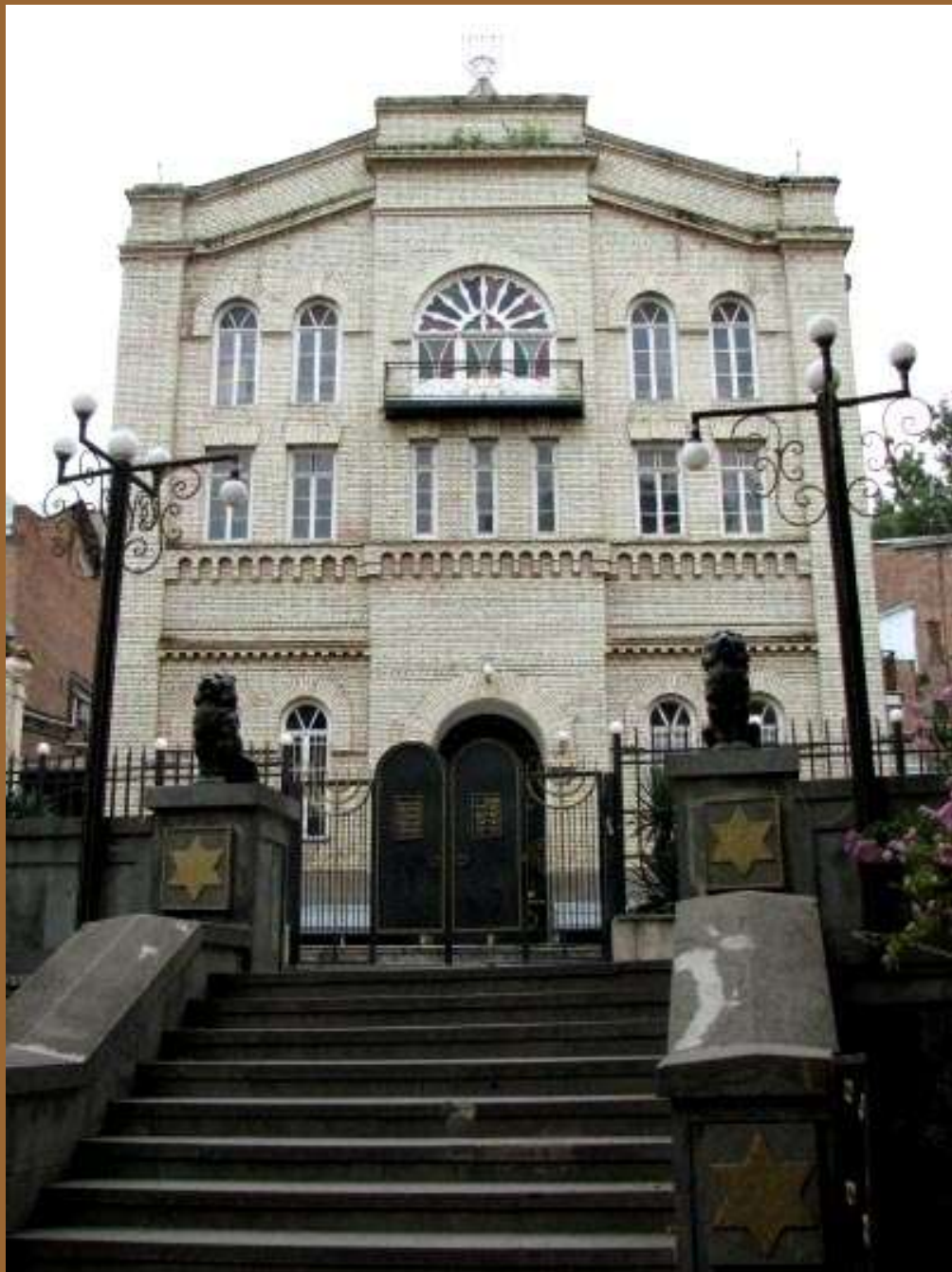
Synagogue in Old Tbilisi