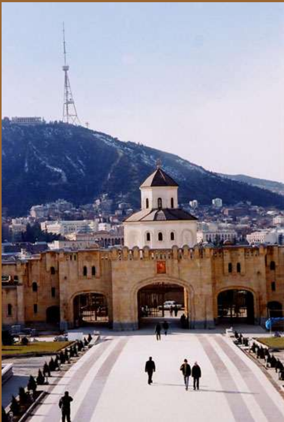
View of the Holy Mount Mtatsminda, Tbilisi, Capital of Georgia