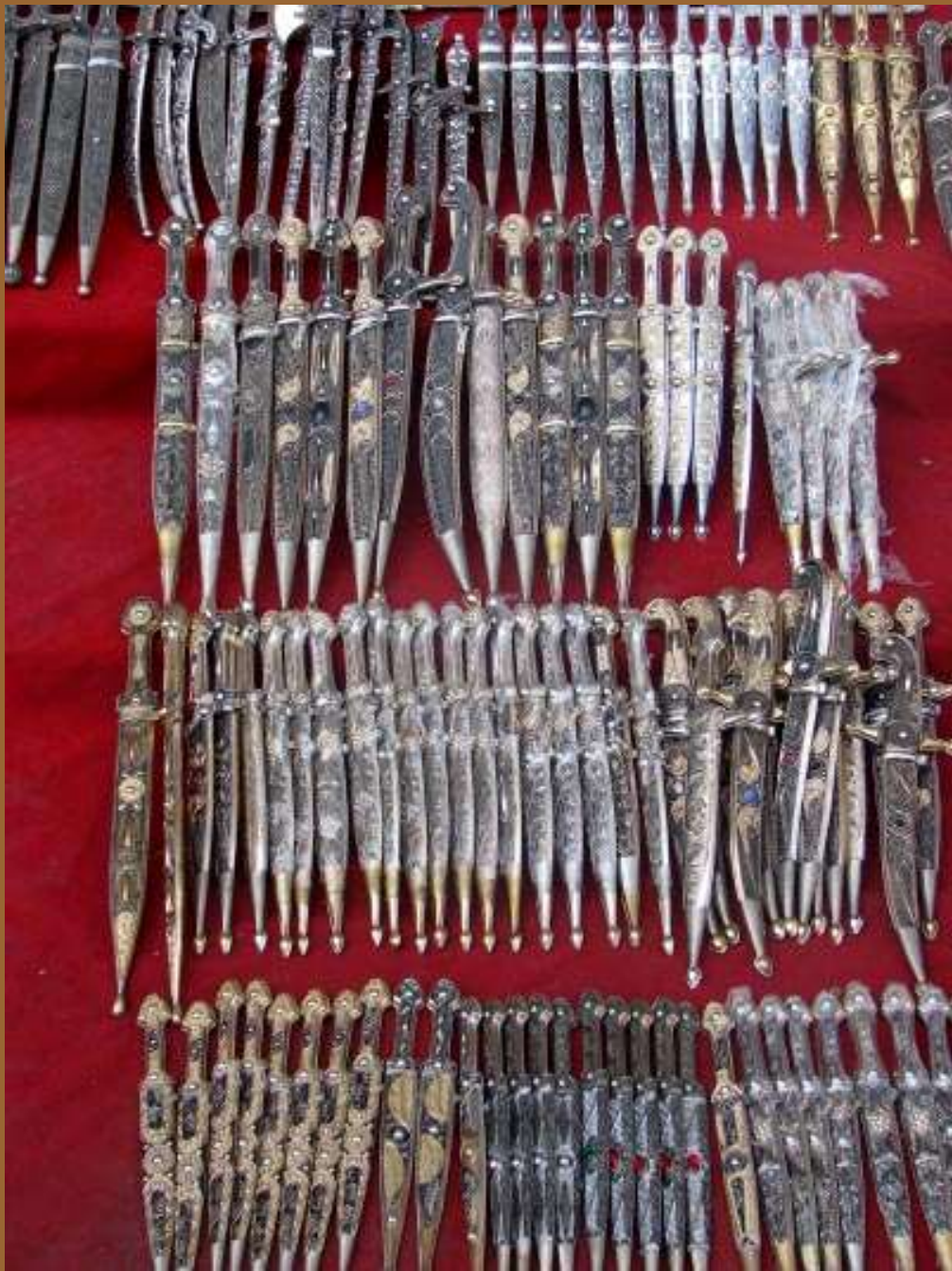
Traditional Daggers displayed by a Street Vendor