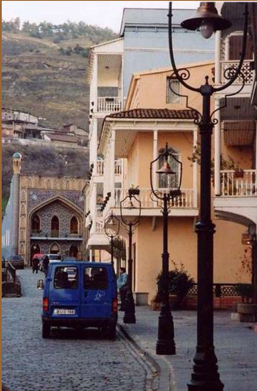
Chreli Abano, Bathhouse in Old Tbilisi