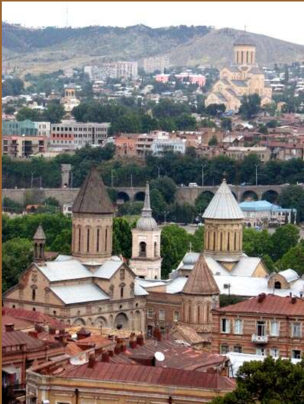
View of Old Tbilisi