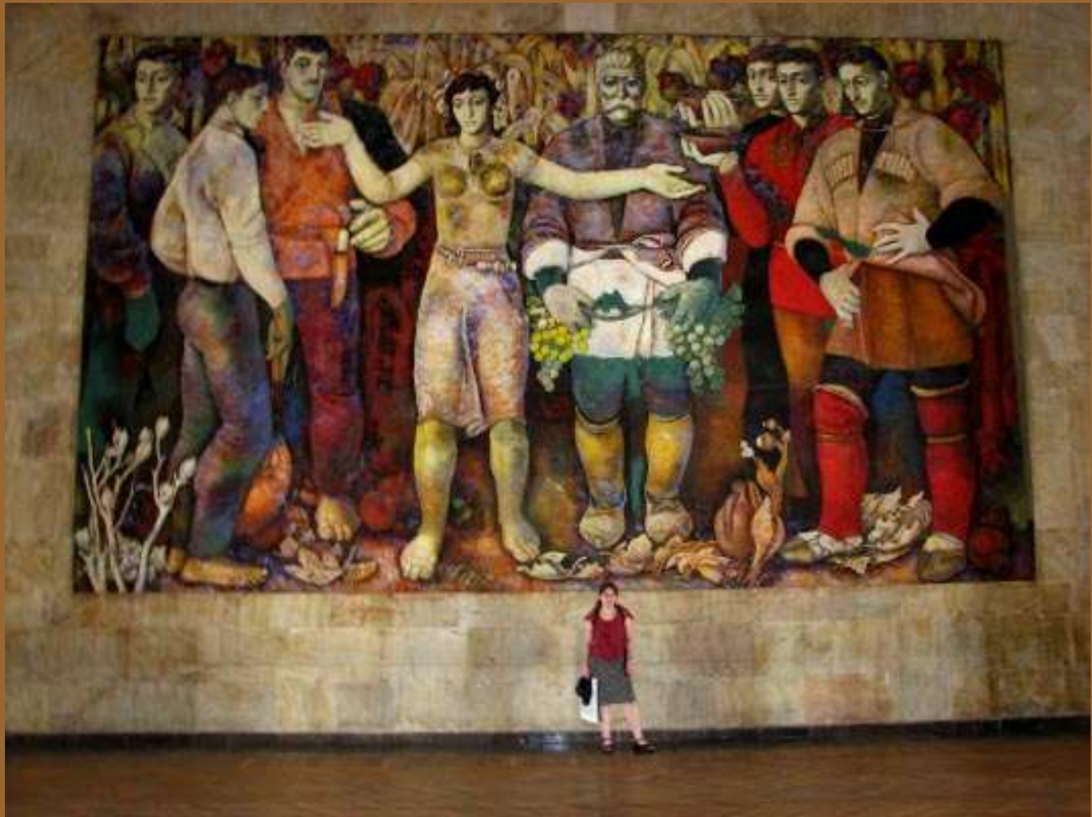
Wall Painting at the Tbilisi State University Concert Hall