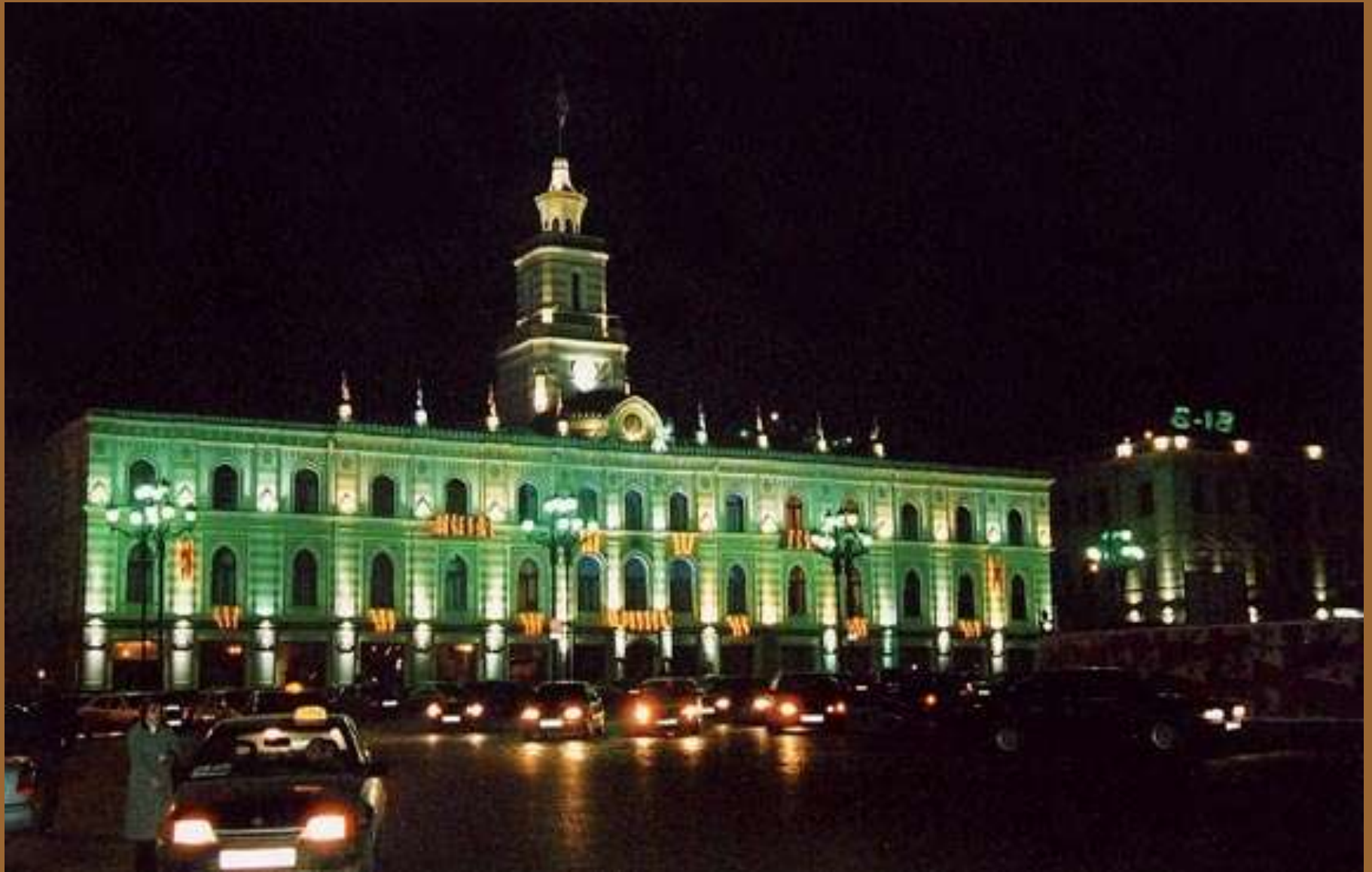
Tbilisi City Hall