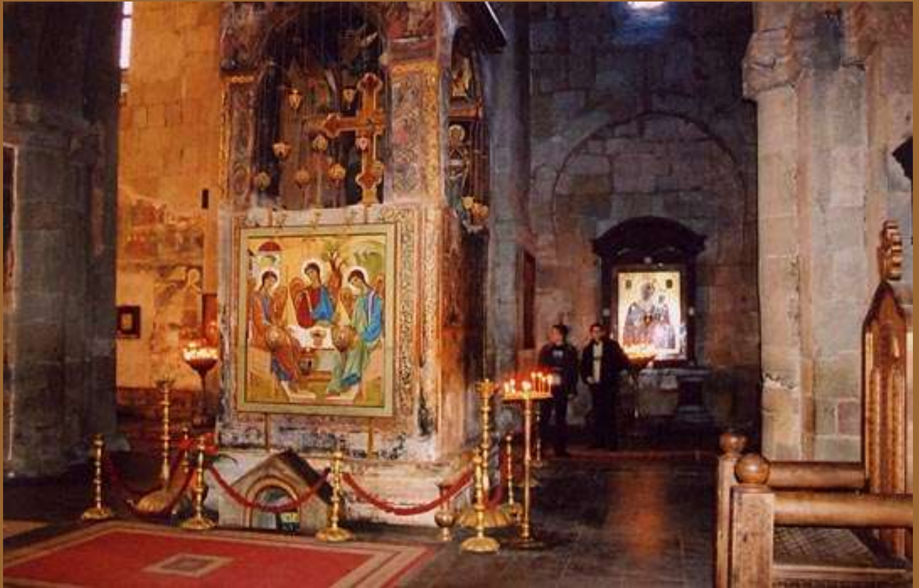
Detail of Interior of the Svetitskhoveli Cathedral