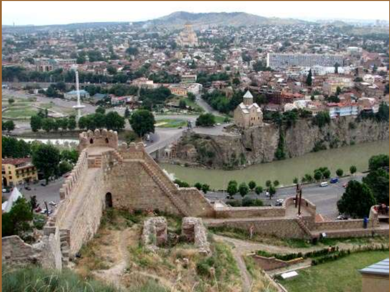
View of Old Tbilisi from the Narikala Fortress