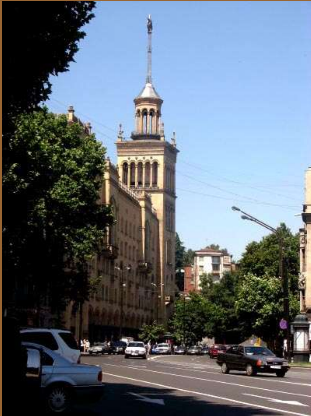
Georgian Academy of Sciences