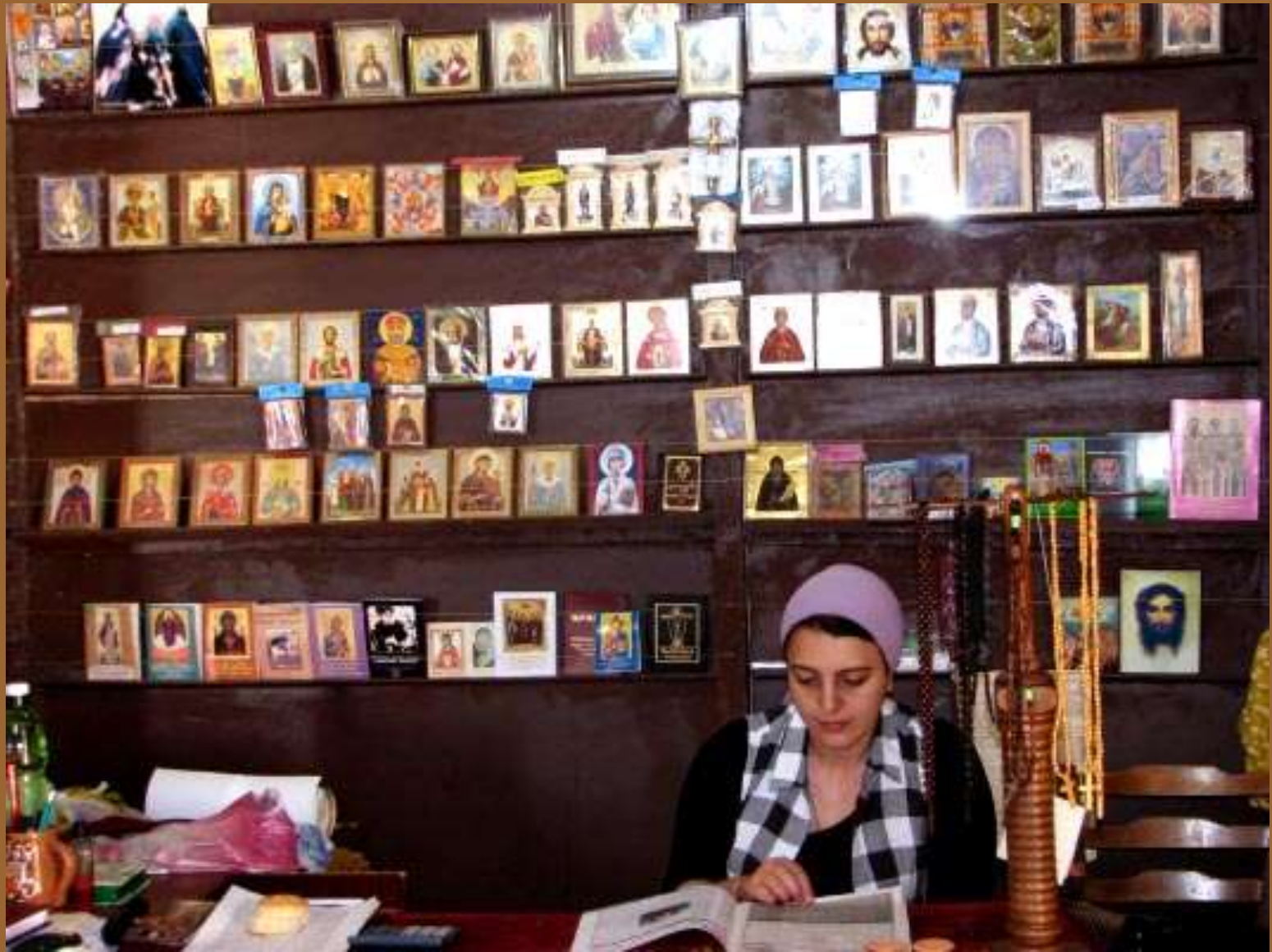
Display of Icons