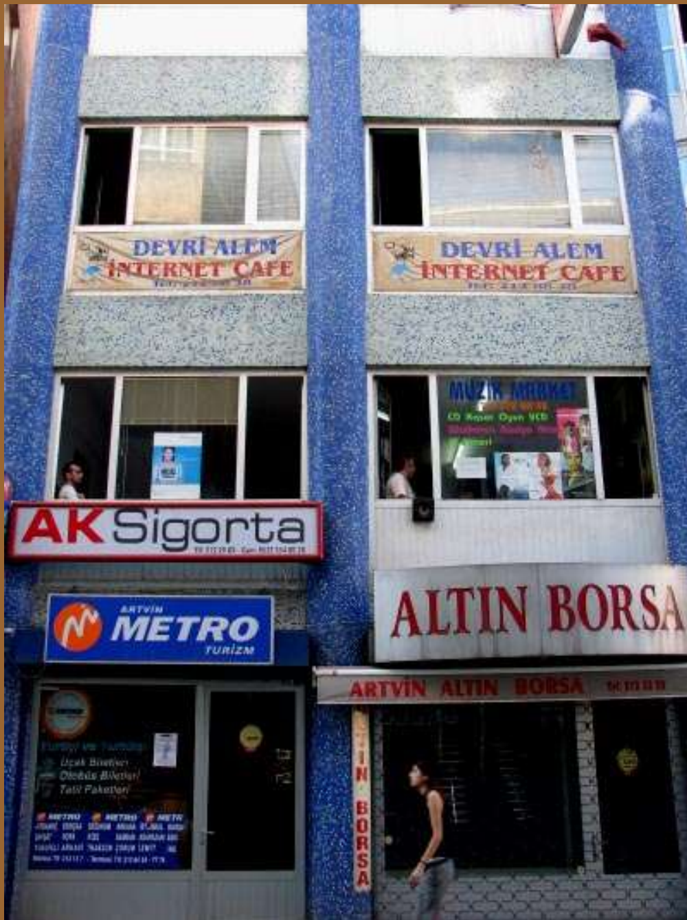
Small Businesses in Artvin