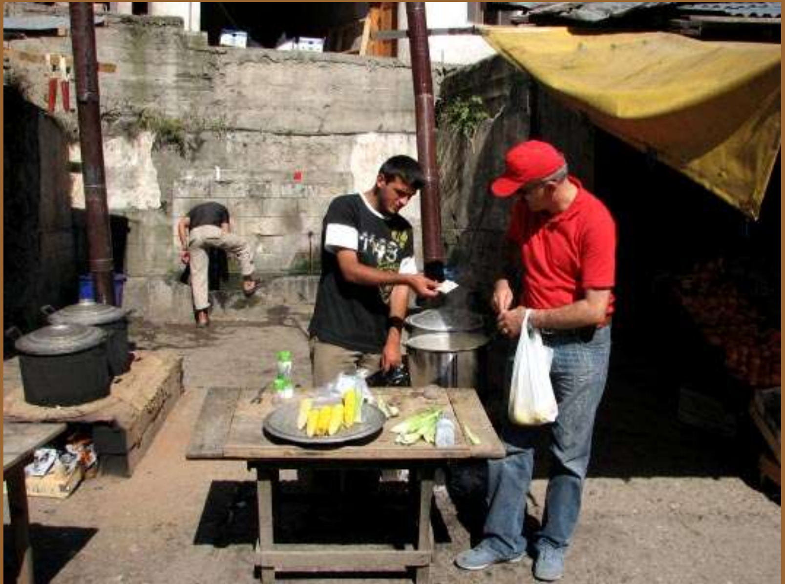
Street Vendor Selling Hot Corn