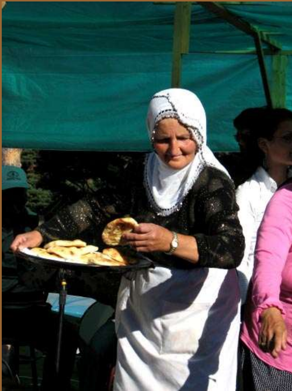
Woman Giving Freshly Baked Gevrek Breads to the Festival Participants