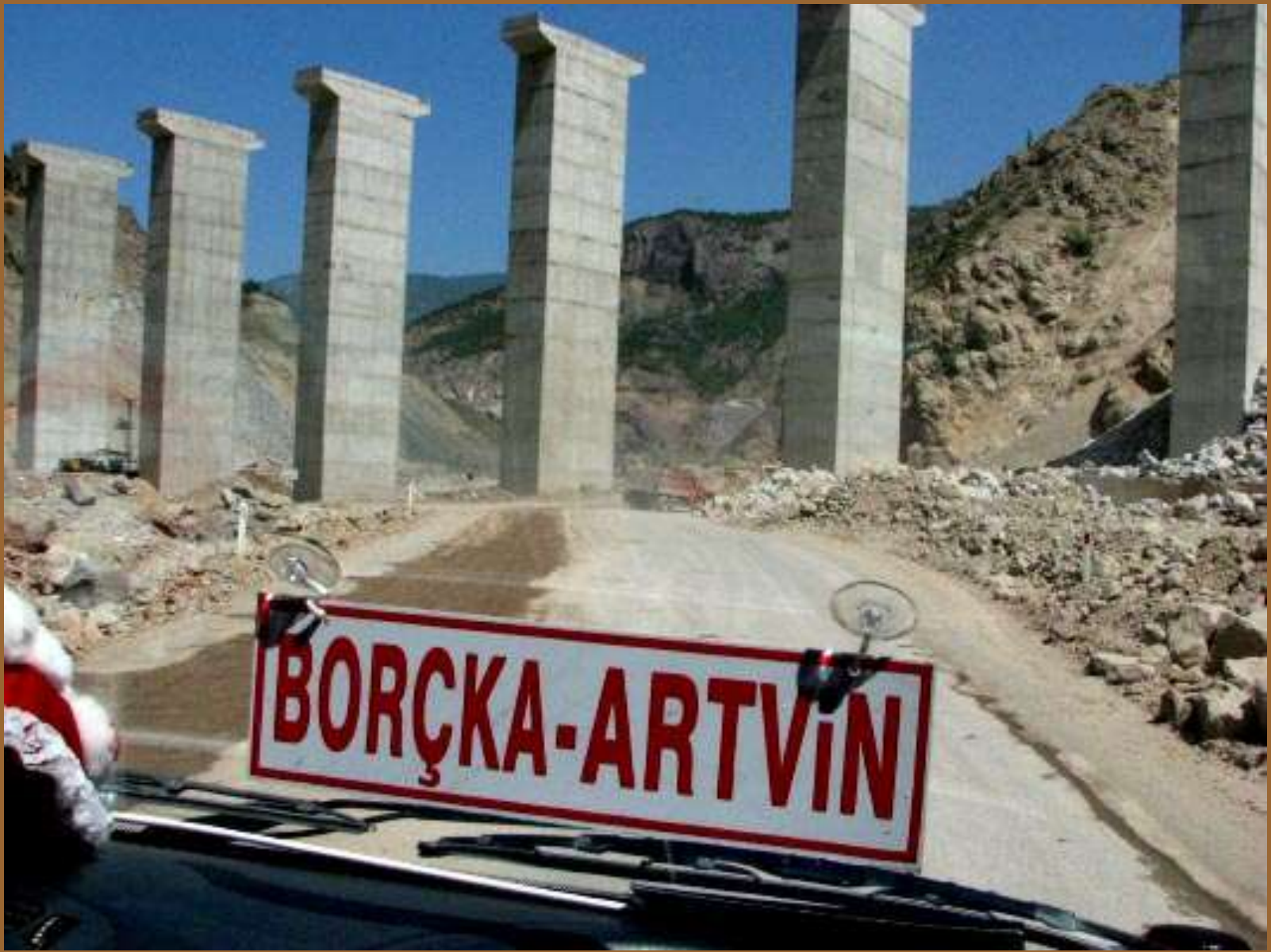
Construction of a new Bridge