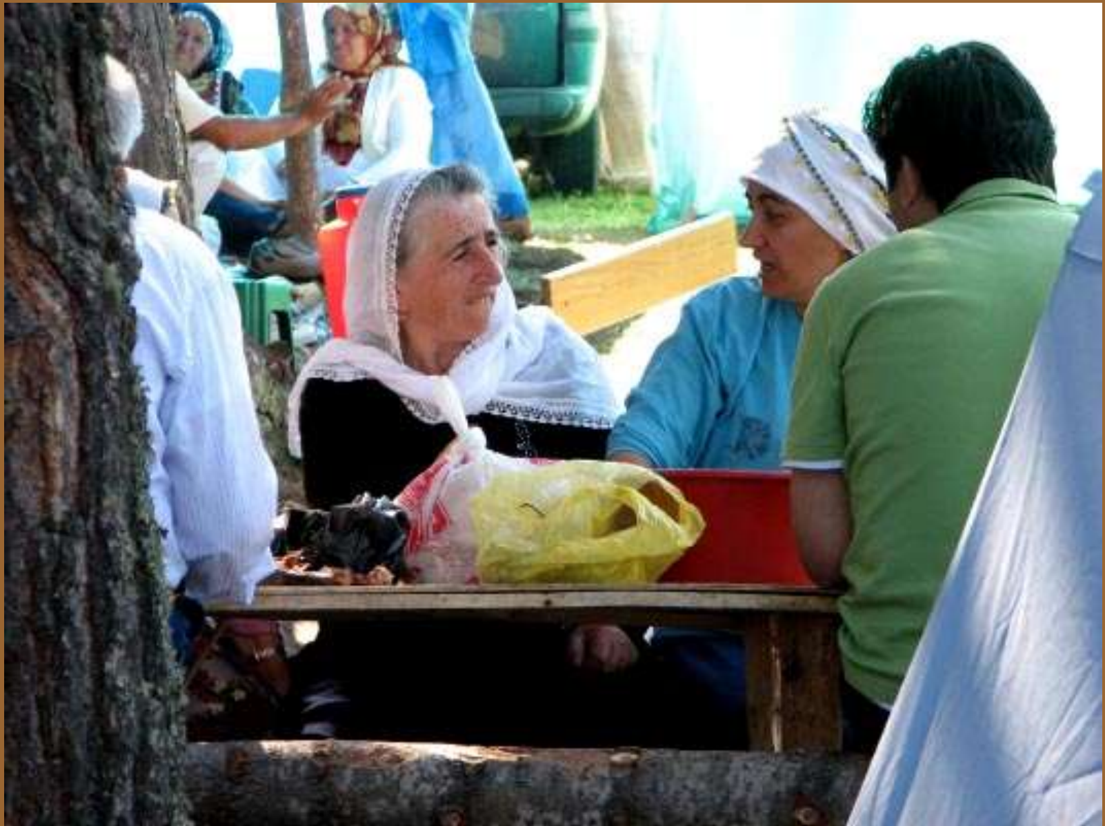
Local Women at the Festival