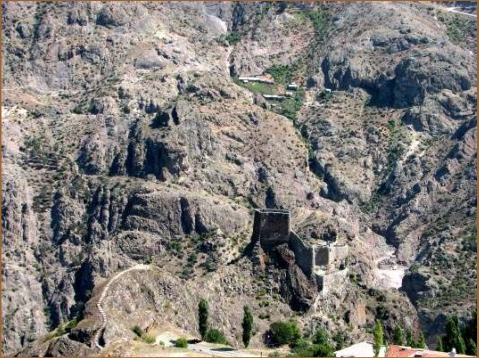
View of the Old Castle from Artvin