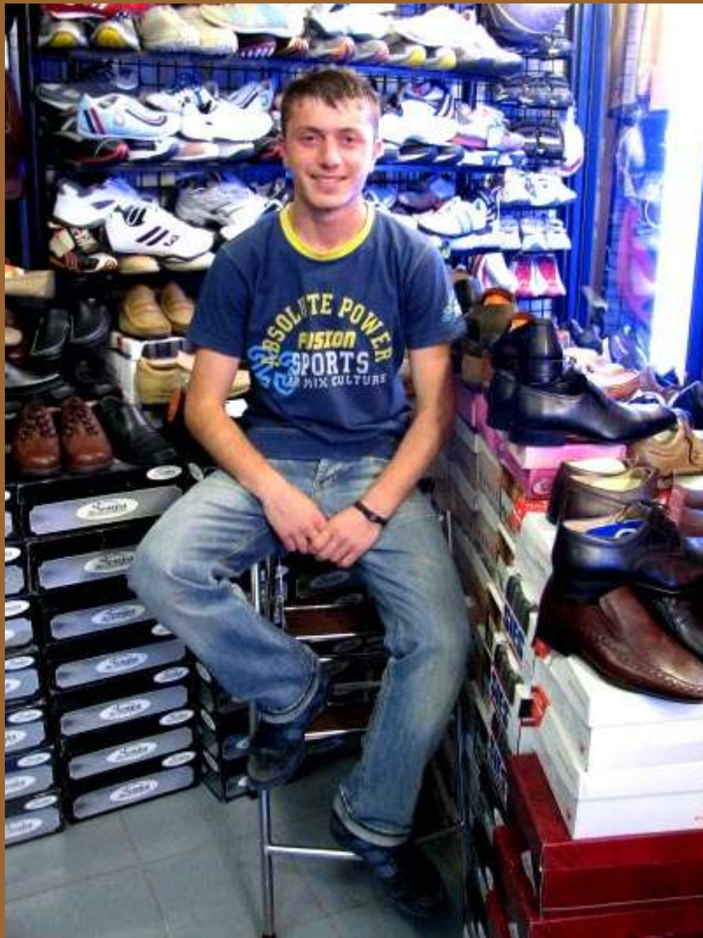
Young Worker at the Shoe store in Artvin