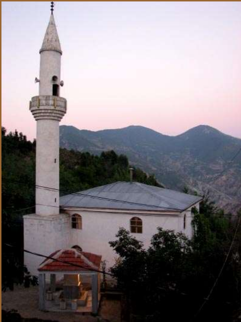
Mosque in Hamamli