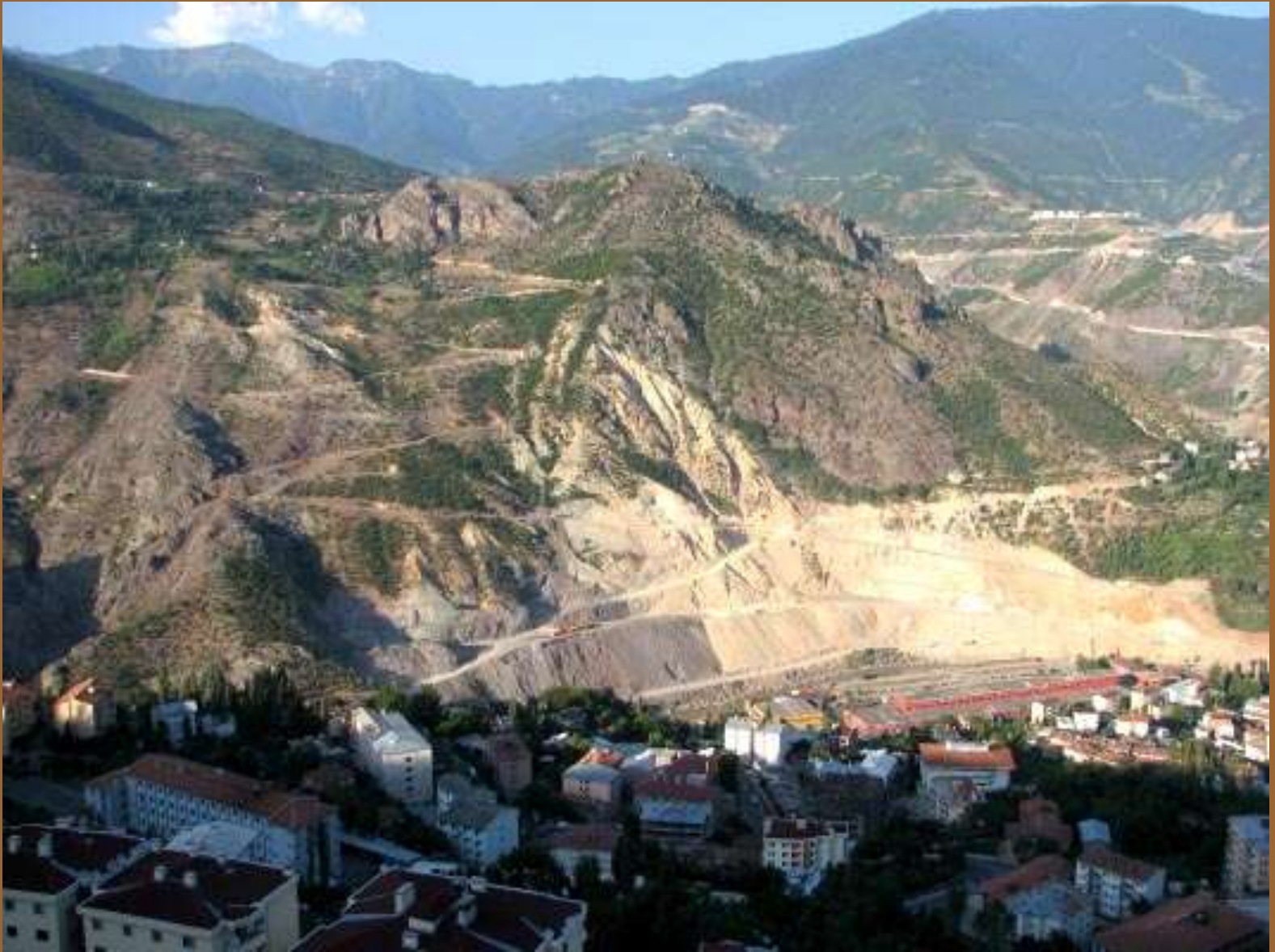
City of Artvin