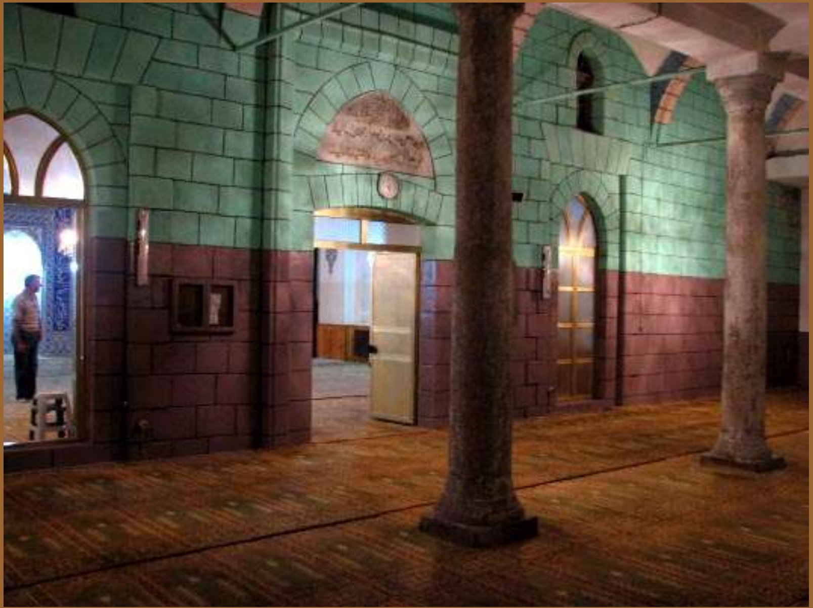
Entrance of the Mosque