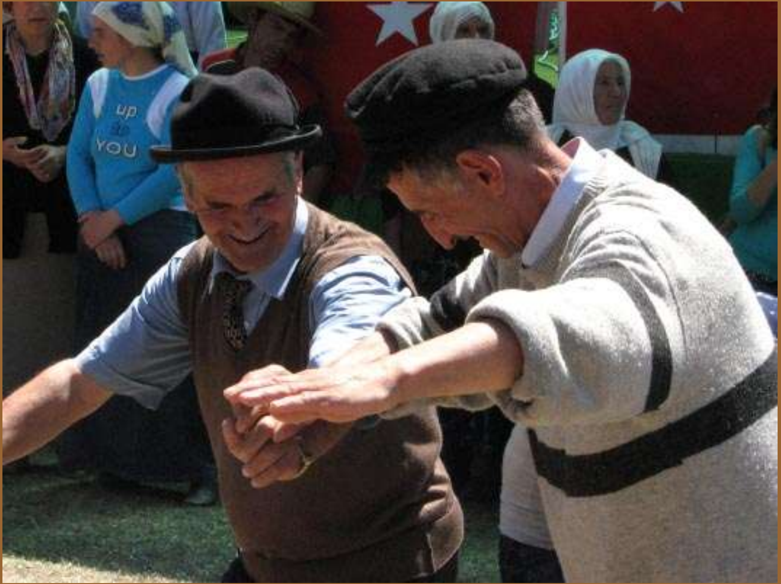
Elderly Men Dancing at the Festival