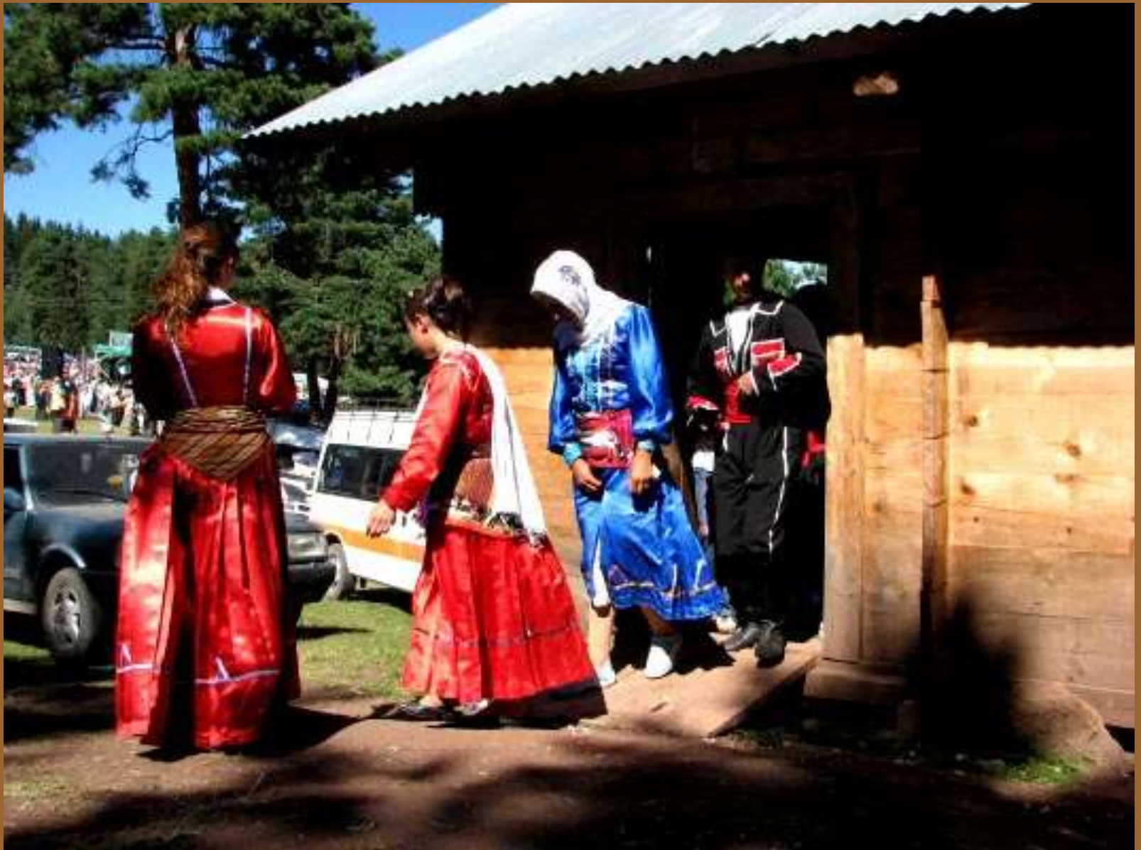
Young Women from the Village of Bazgireti wearing Traditional Clothing