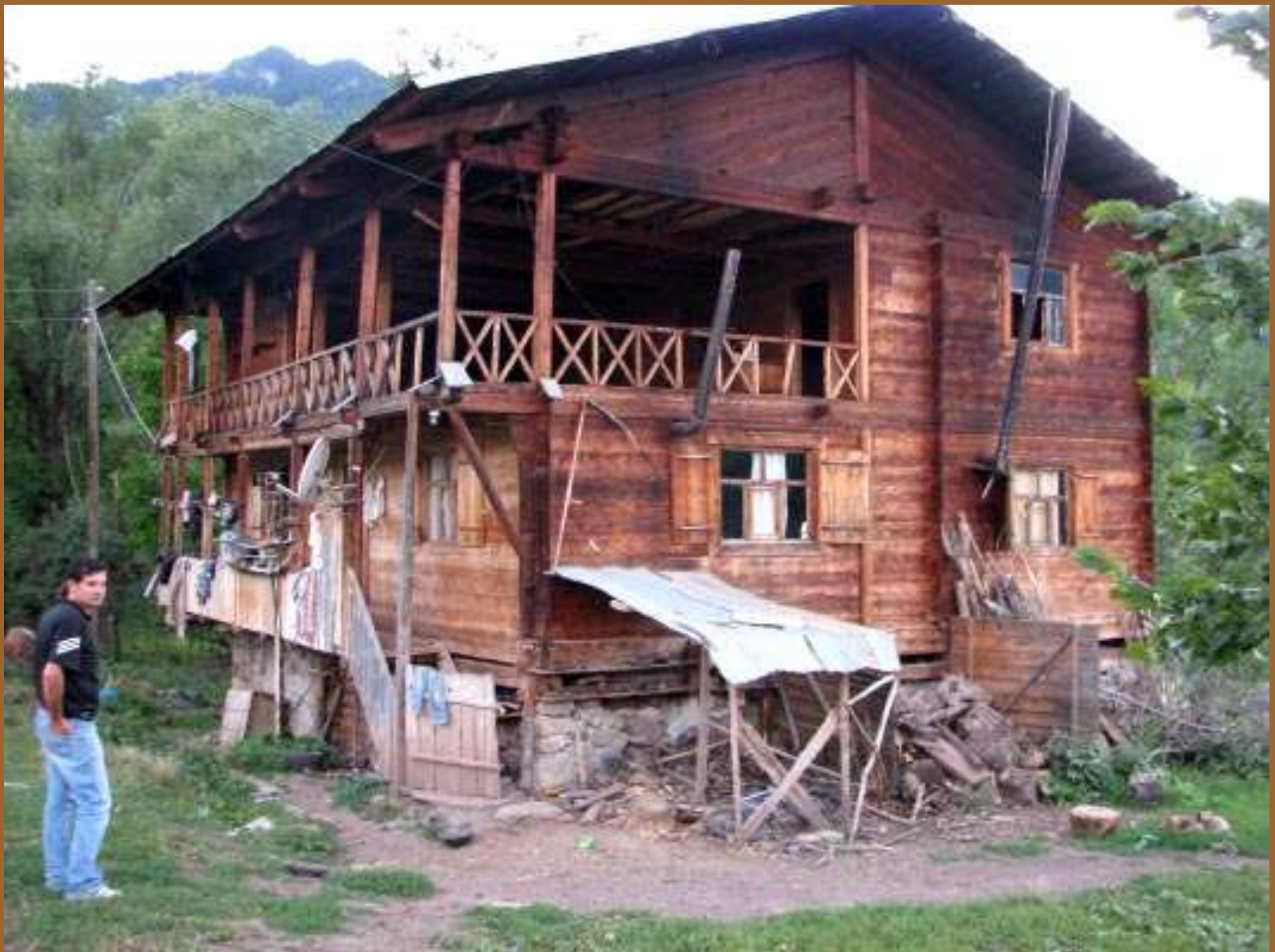
Traditional House in Meydanchik, Imerkhevi