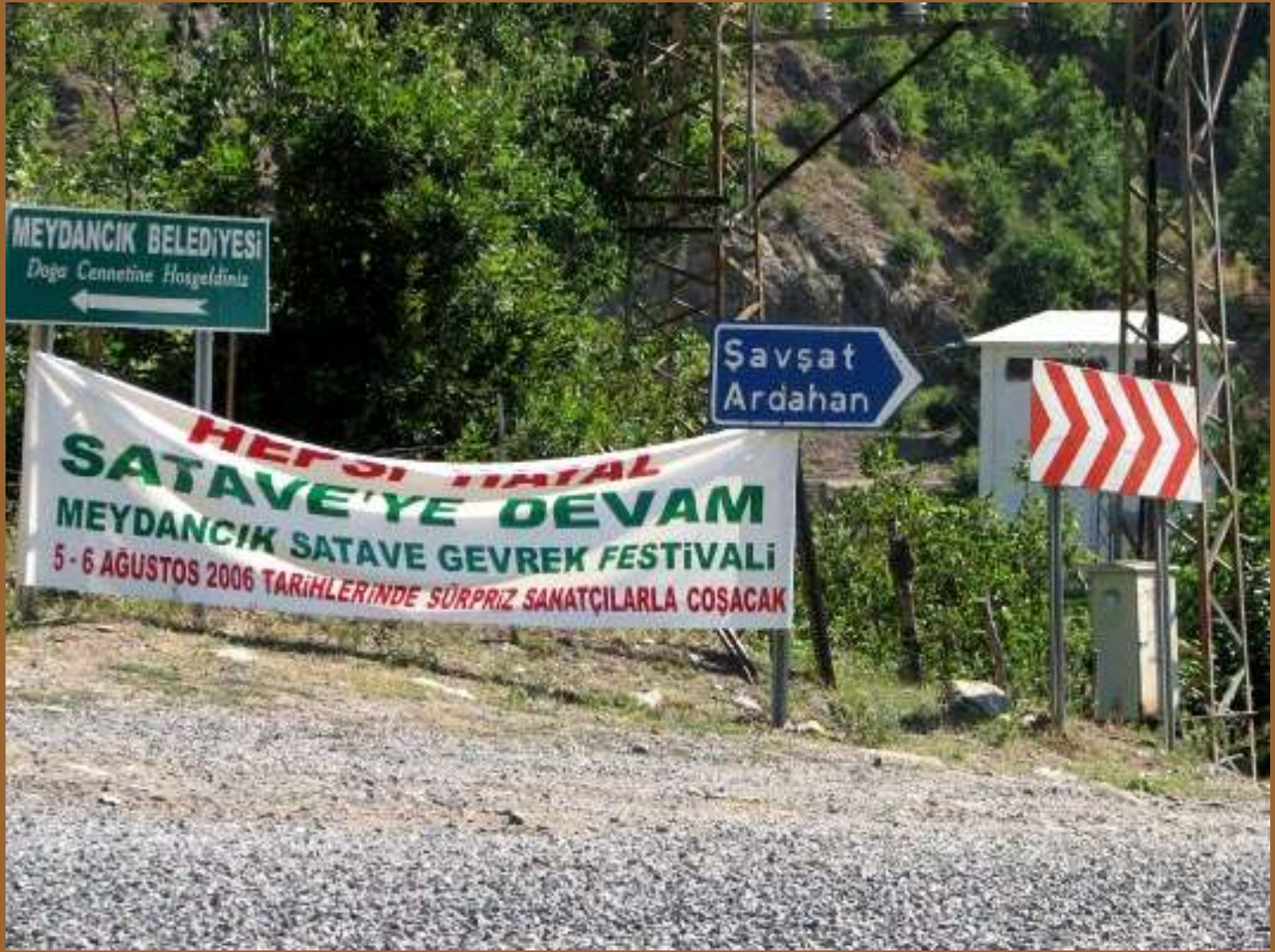
Add for the Festival of "Satave" in Imerkhevi