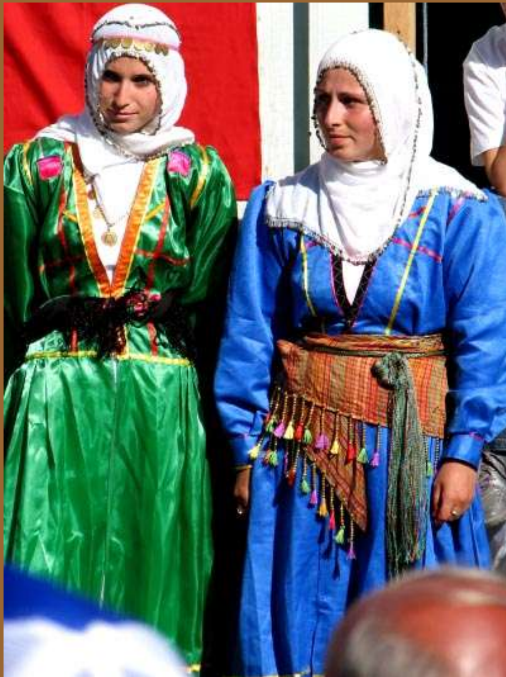
Young Women participating in a Beauty Contest at the Festival