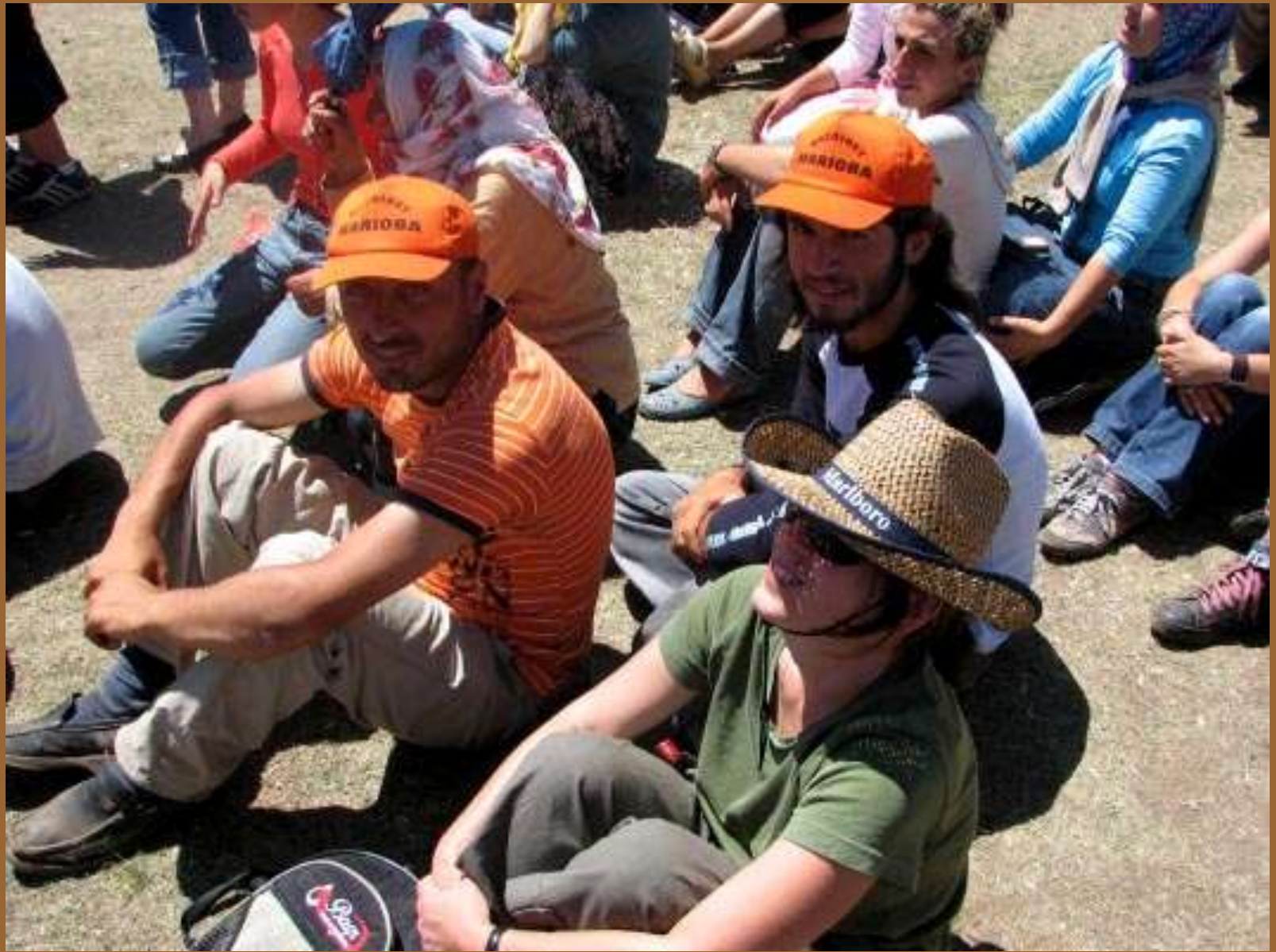
Young Men from the Village of Bazgireti wearing caps with the Festival of “Marioba” sign, Meydanchik, Satave