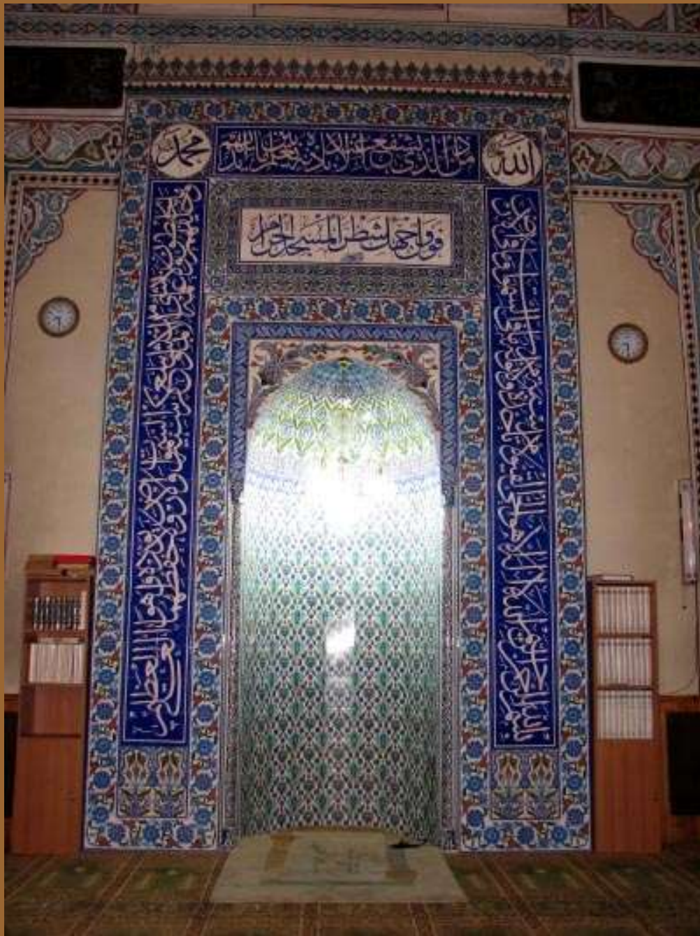
Interior of the Mosque