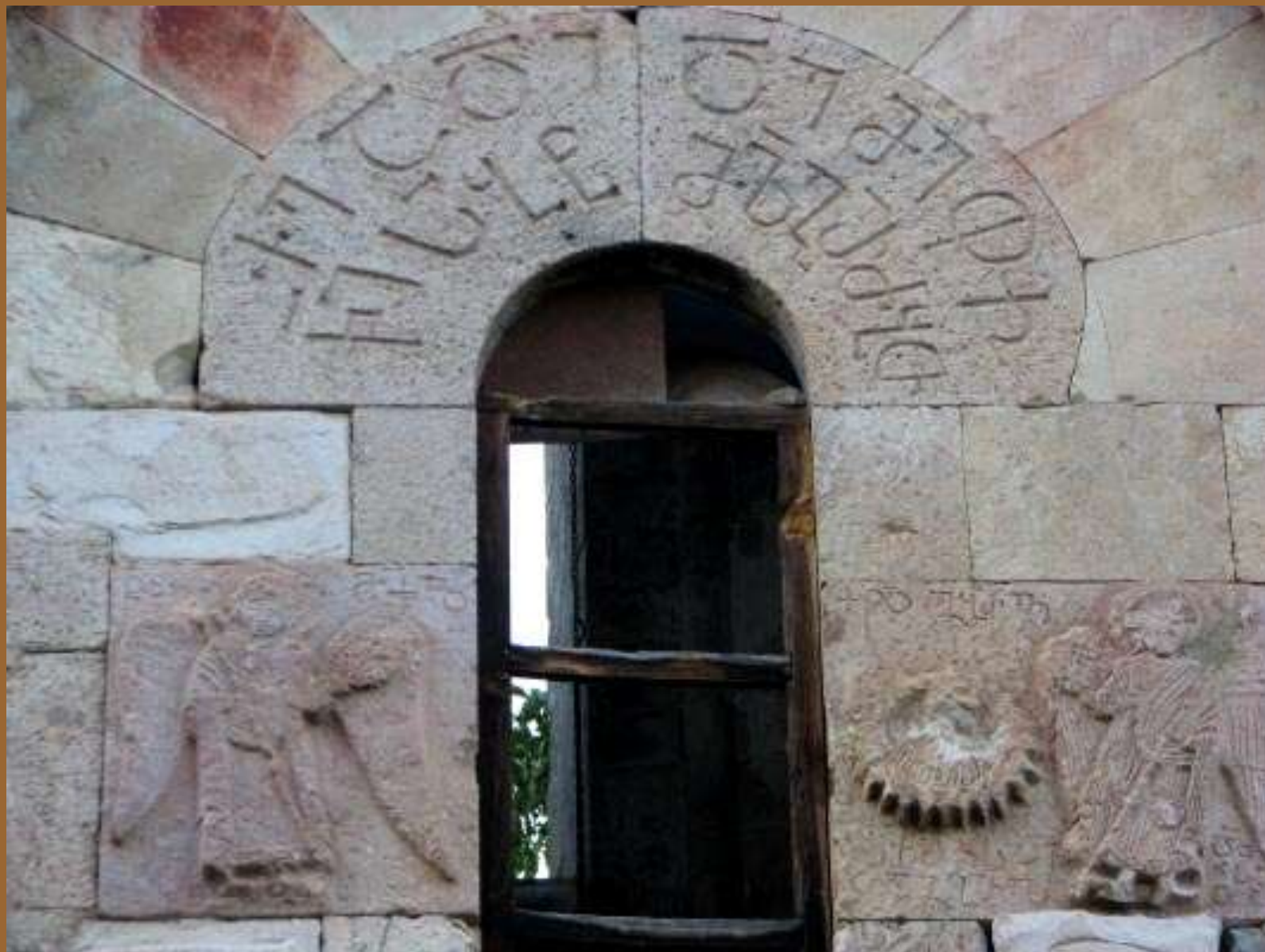
Detail of the Doliskana Church with the Old Georgian “Asomtavruli” Inscription