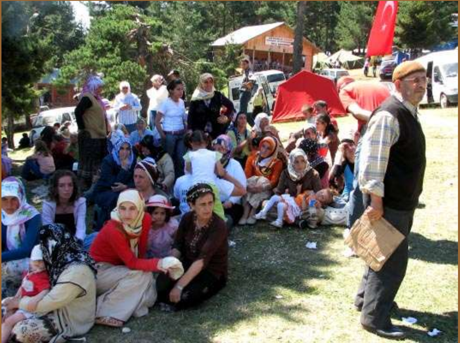
Women and Children at the Festival