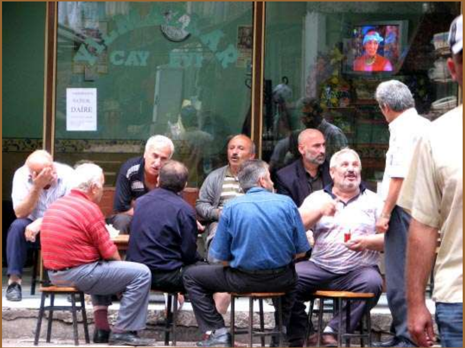
Street in Hopa