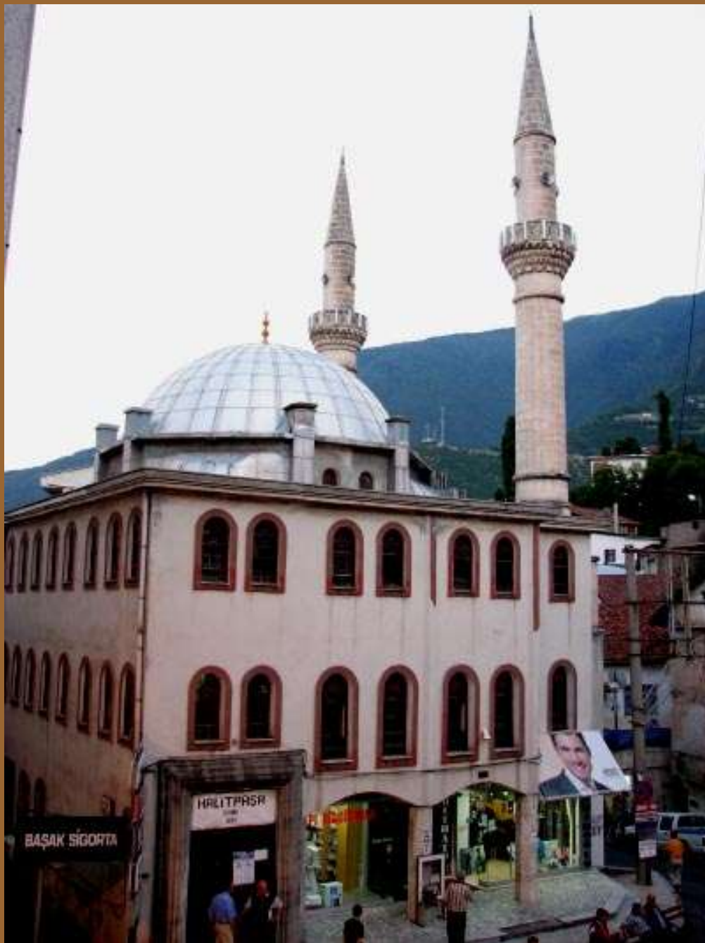
Mosque in Artvin