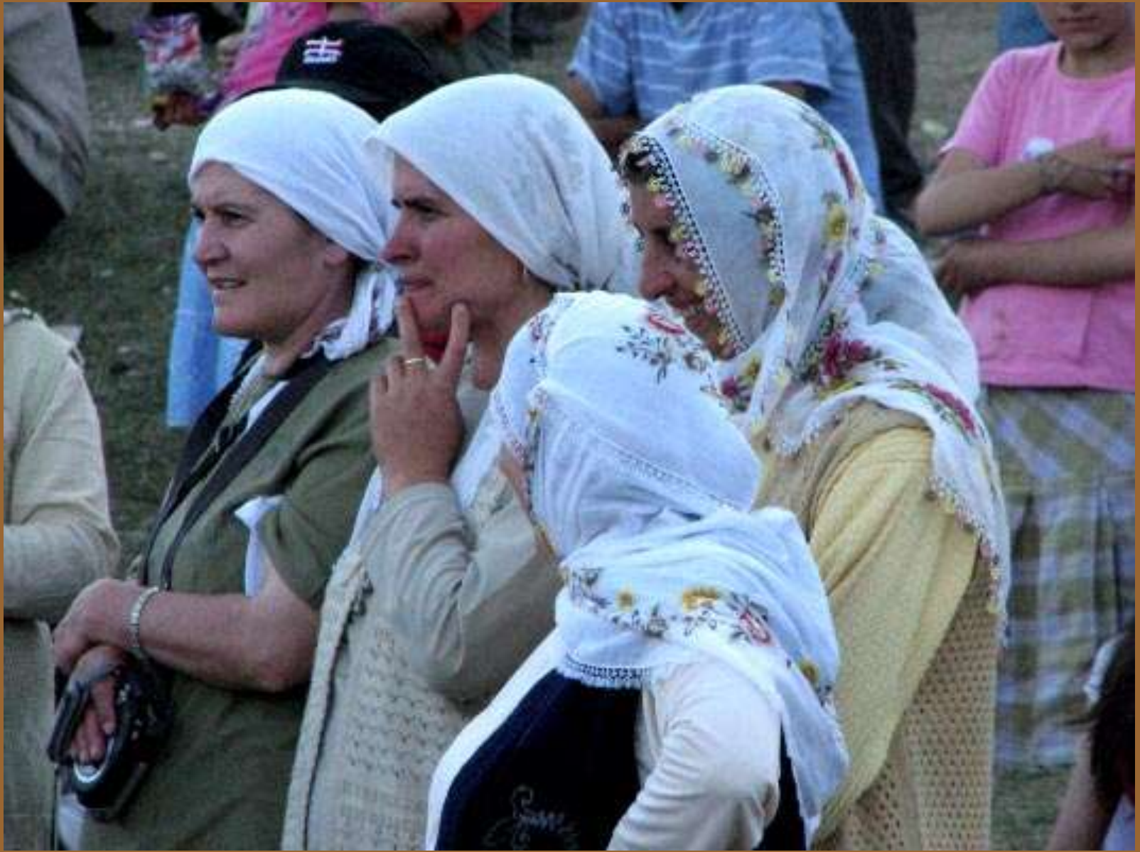
Women Watching Dancers at the Festival