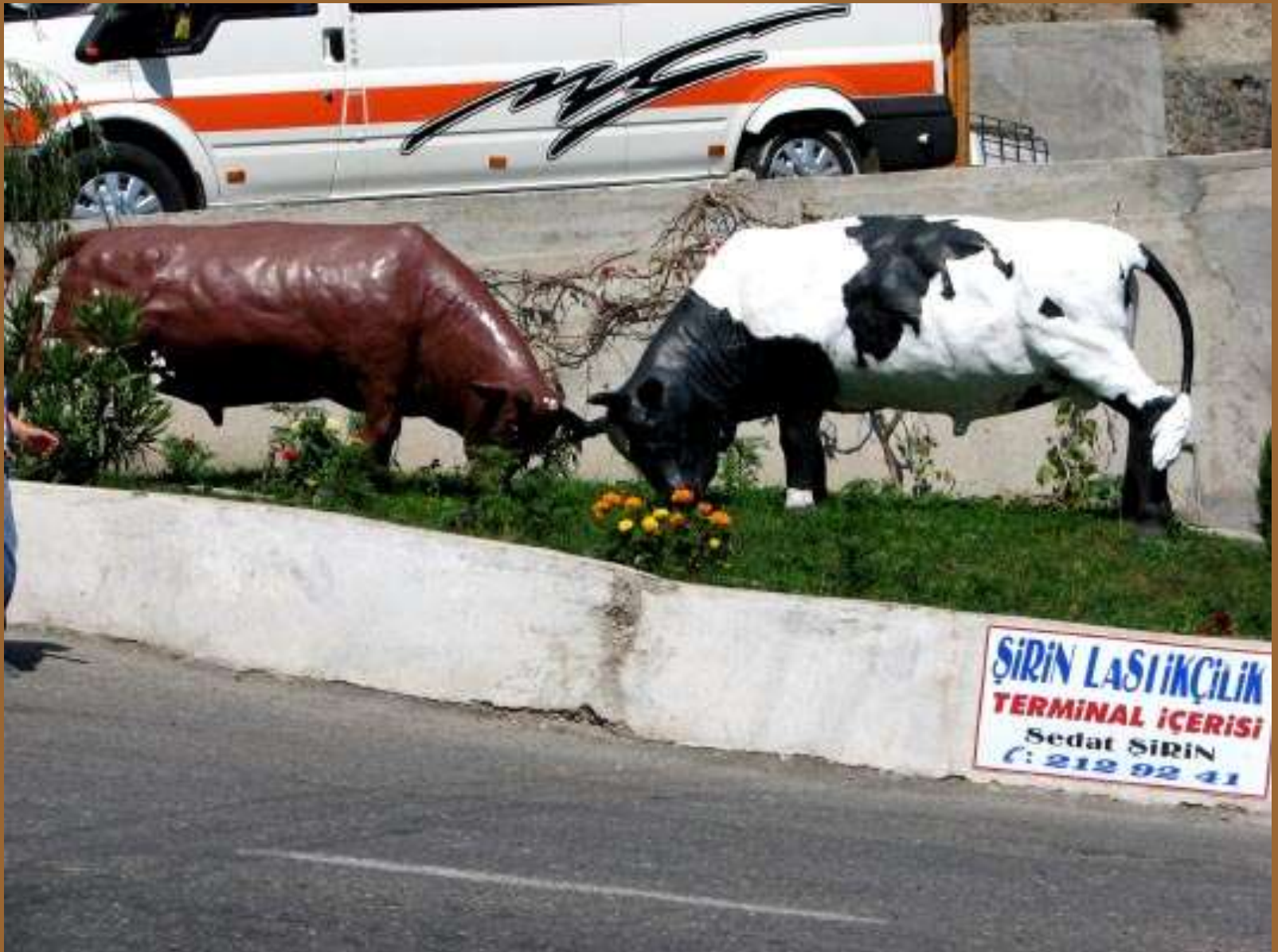
Statue of Bulls in Artvin dedicated to the traditional bullfighting festival “Kafkasor”