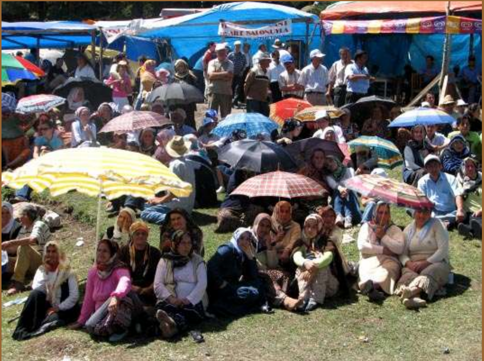
Women at the Festival