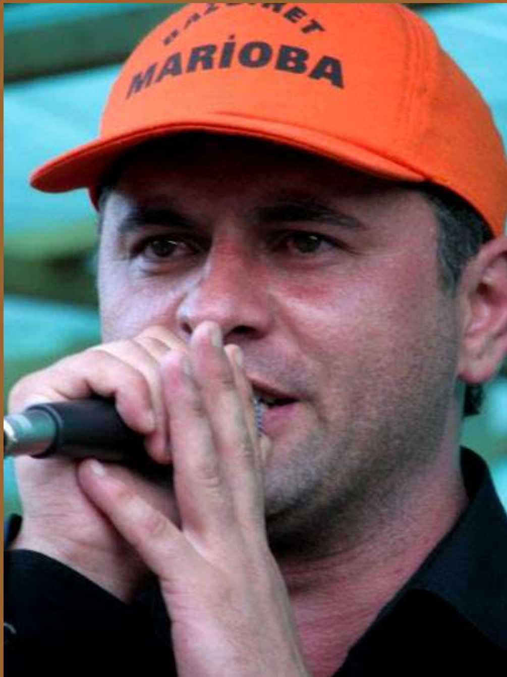
Popular Singer Performing at the Festival