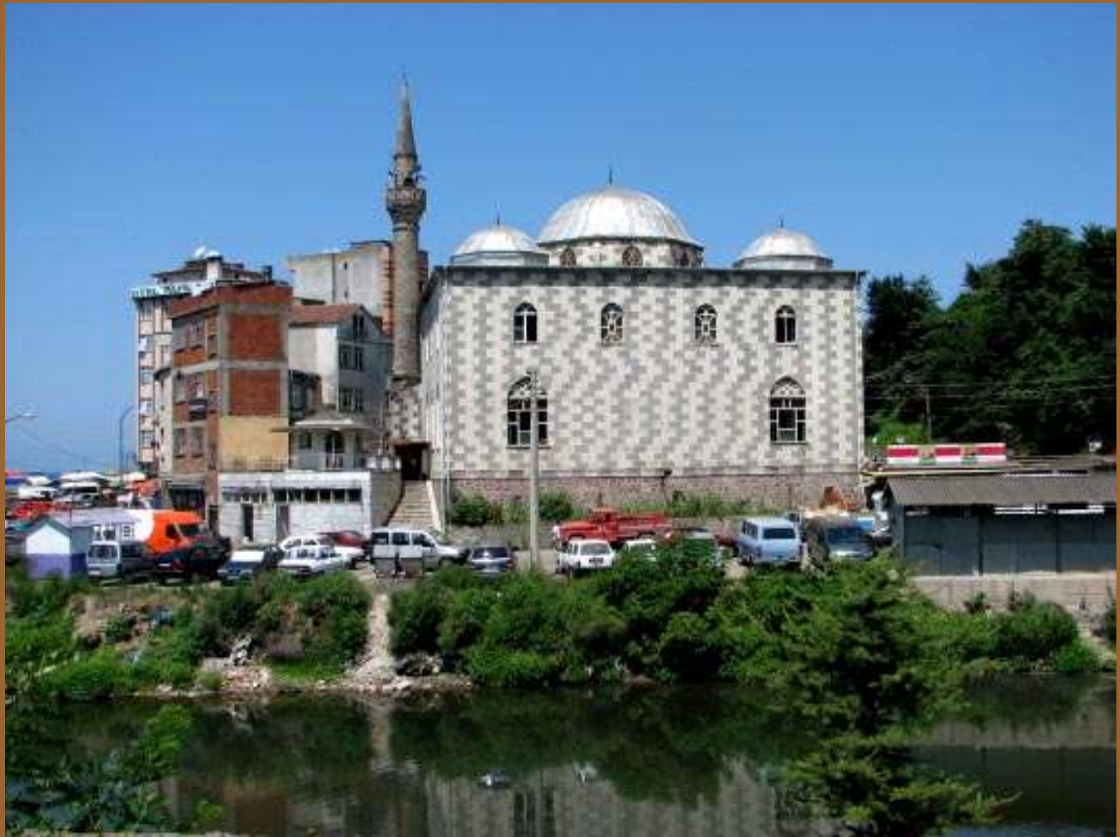
Mosque at the Black Sea Coastal City of Hopa, Turkey