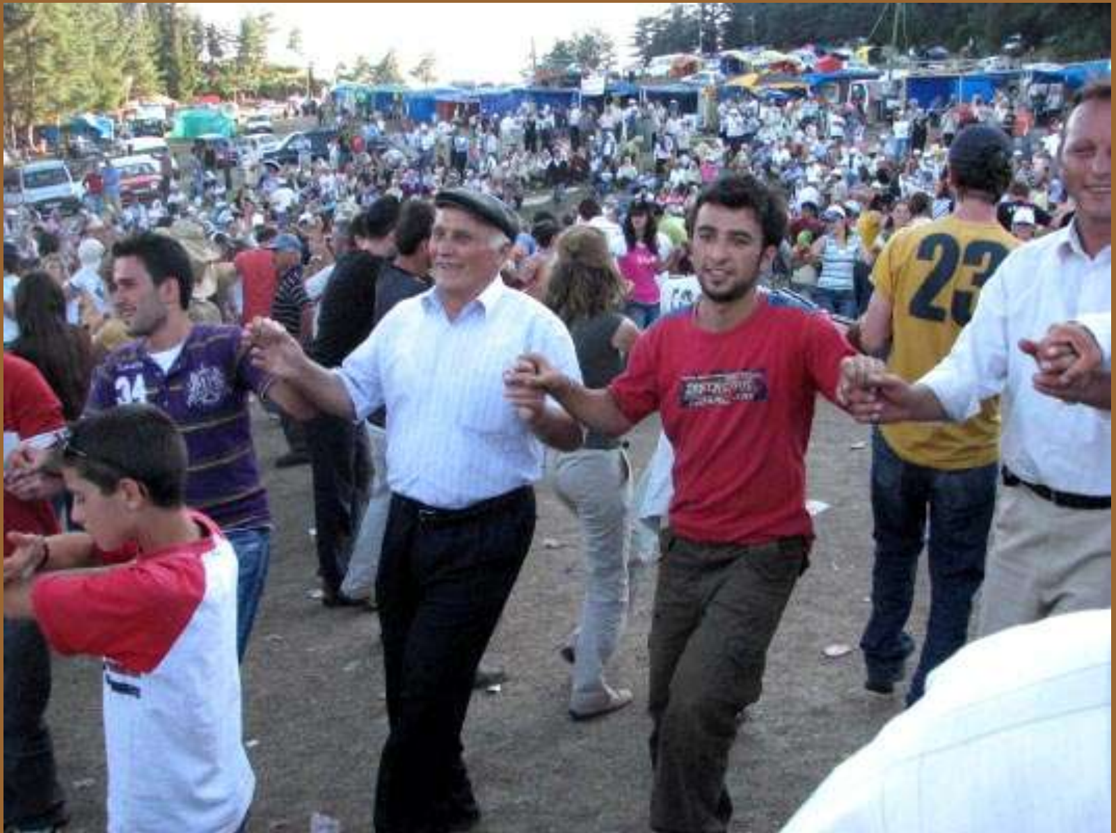
Dancing at the Festival