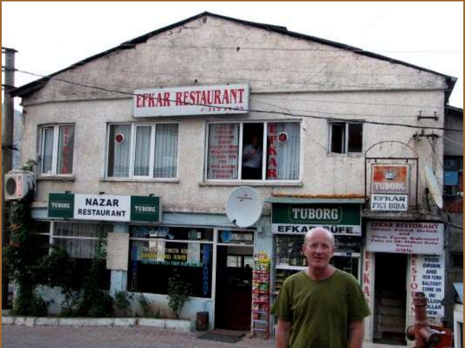
Restaurant with the Best View of Artvin