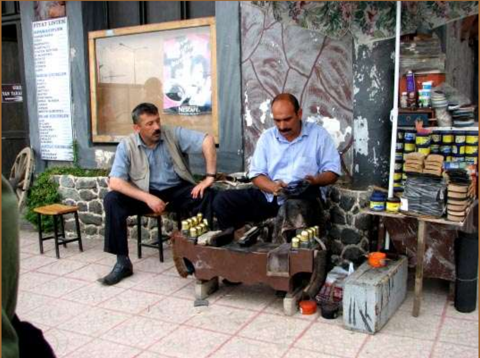
Street in Hopa