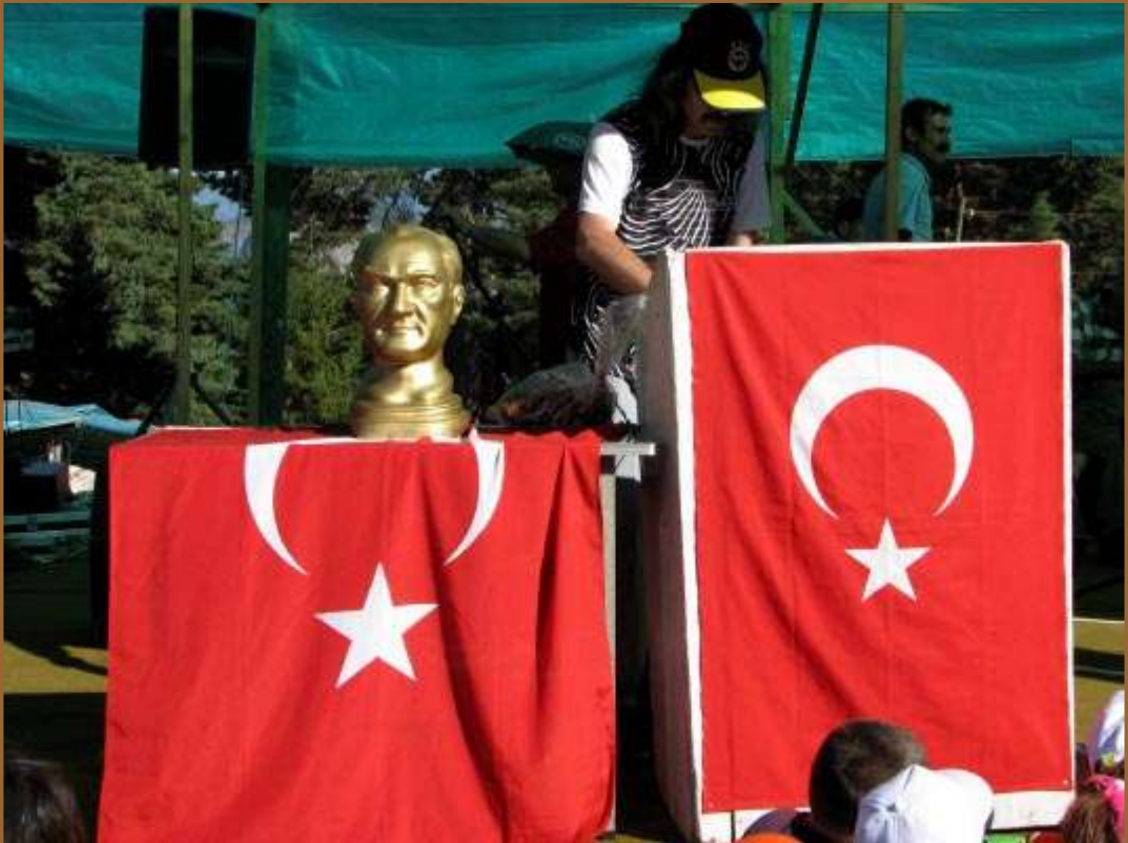
Main Stage at the Festival with the Statue of Mustafa Kemal Atatürk