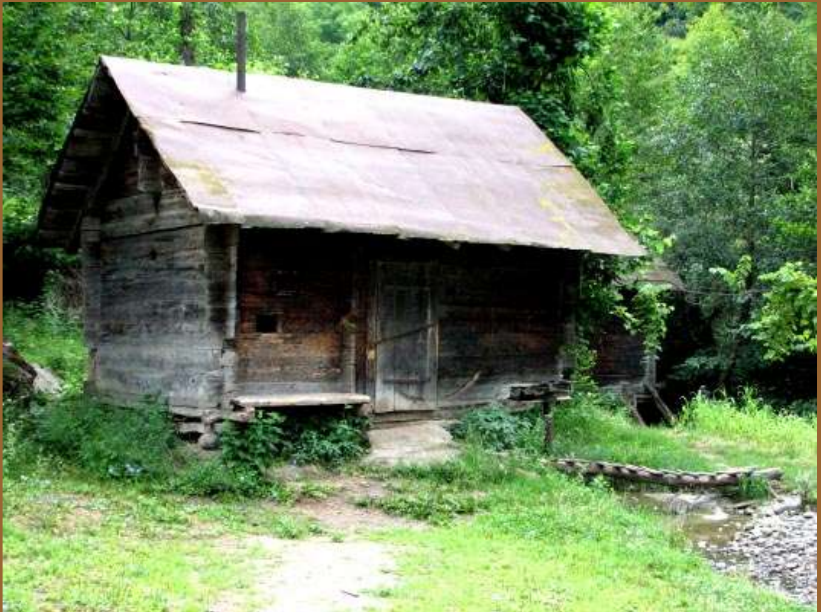
Watermill in the Village of Didachara