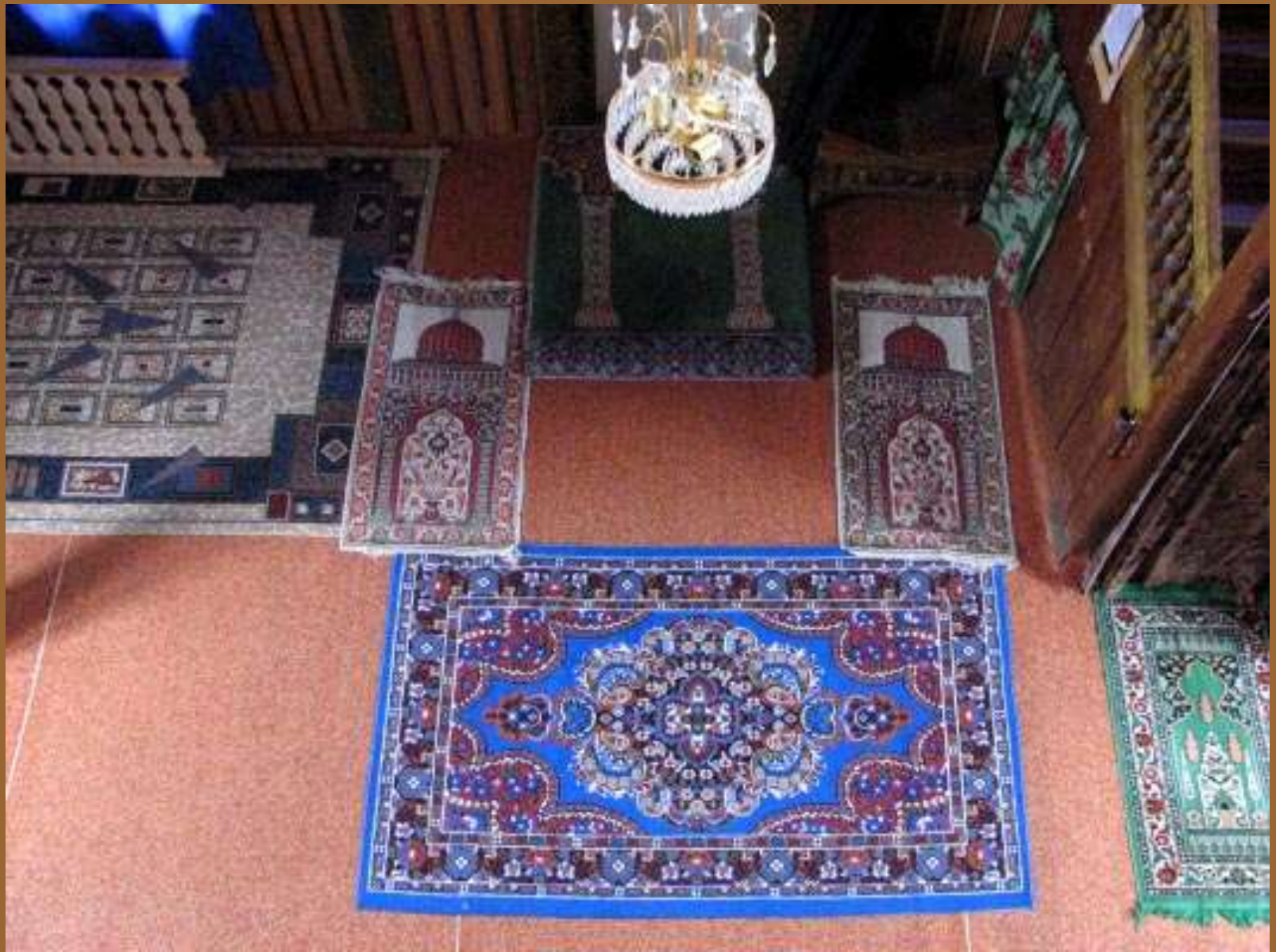
Interior of the Iremadzeebi Village Mosque