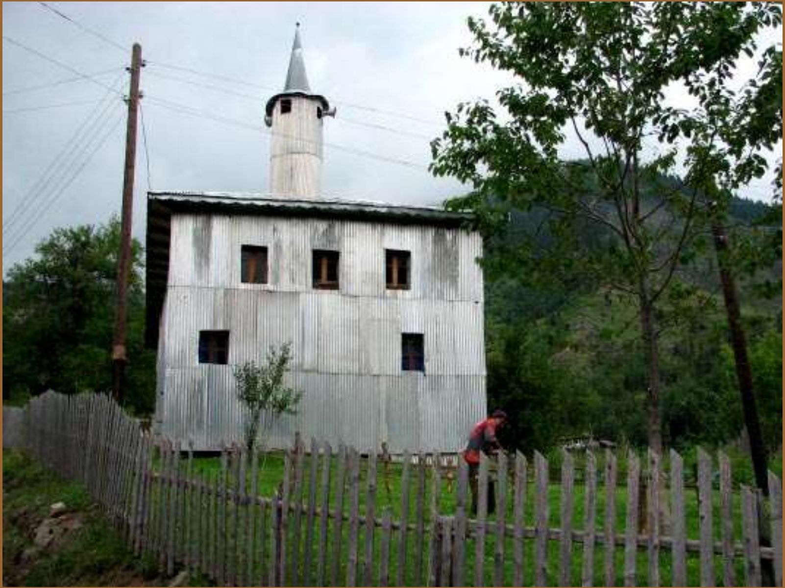
Rebuilt Mosque in the Village of Iremadzeebi, Khulo District of Upper Ajara