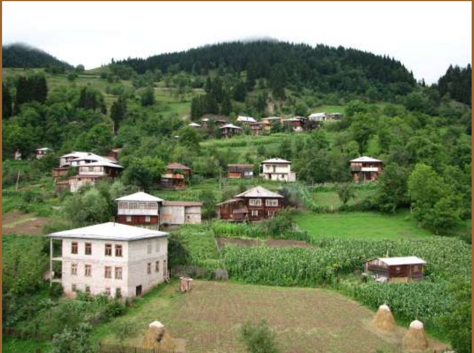
Didachara Village, Khulo District of Upper Ajara