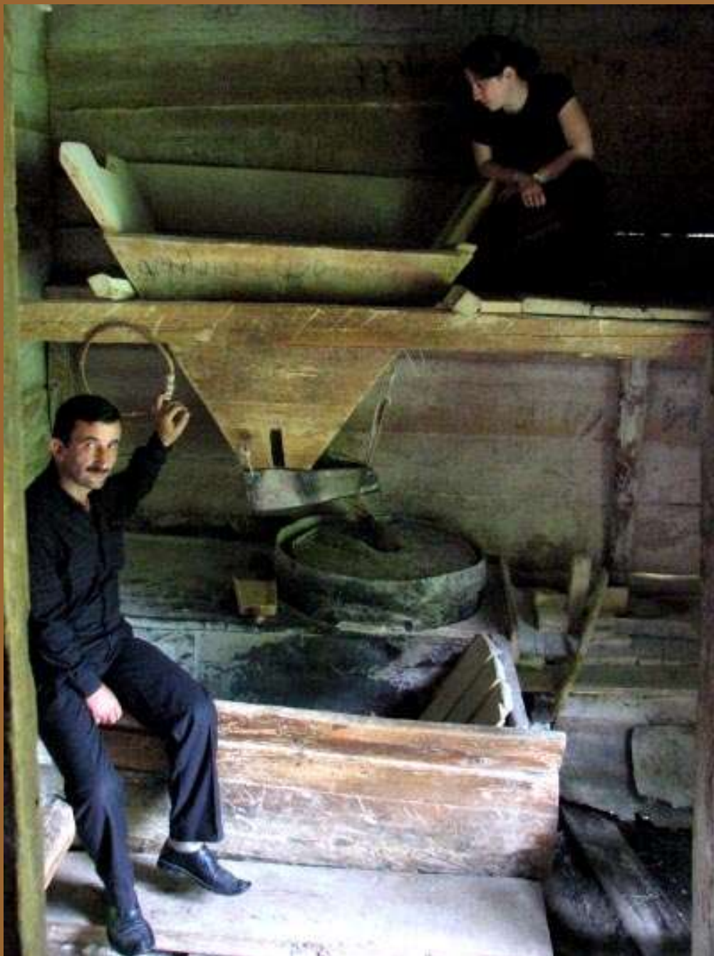
Interior of the Watermill