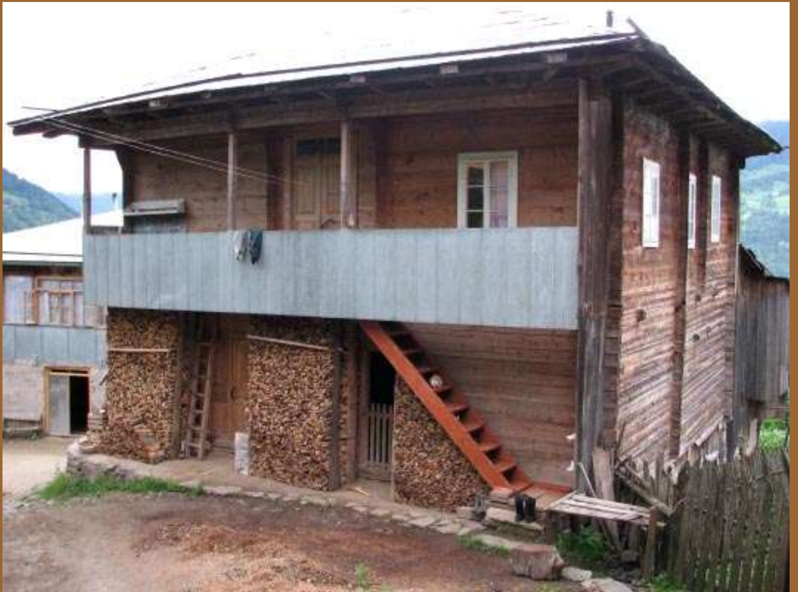
Traditional House in Didachara