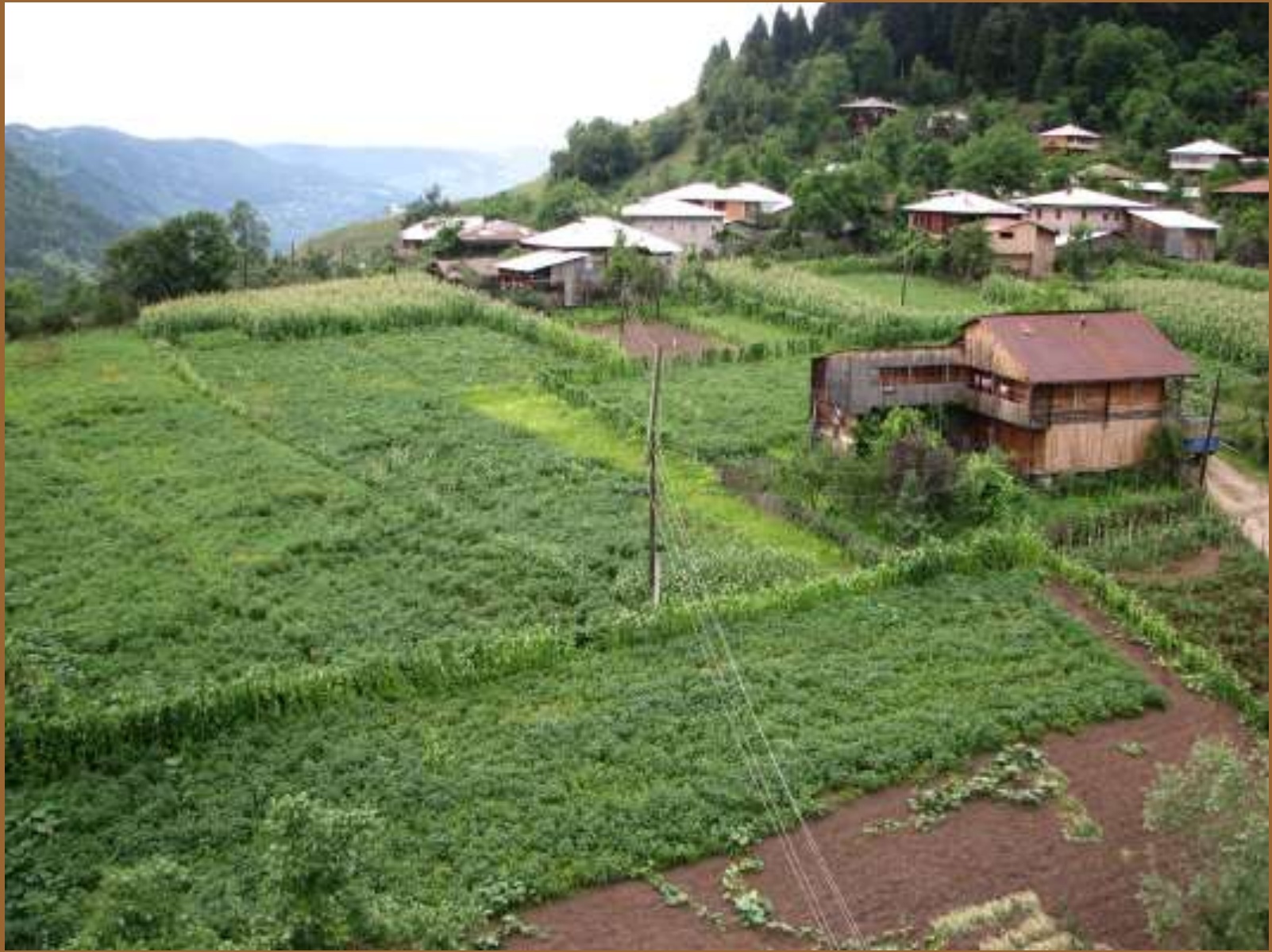
Cornfields and Potato Fields in Didachara