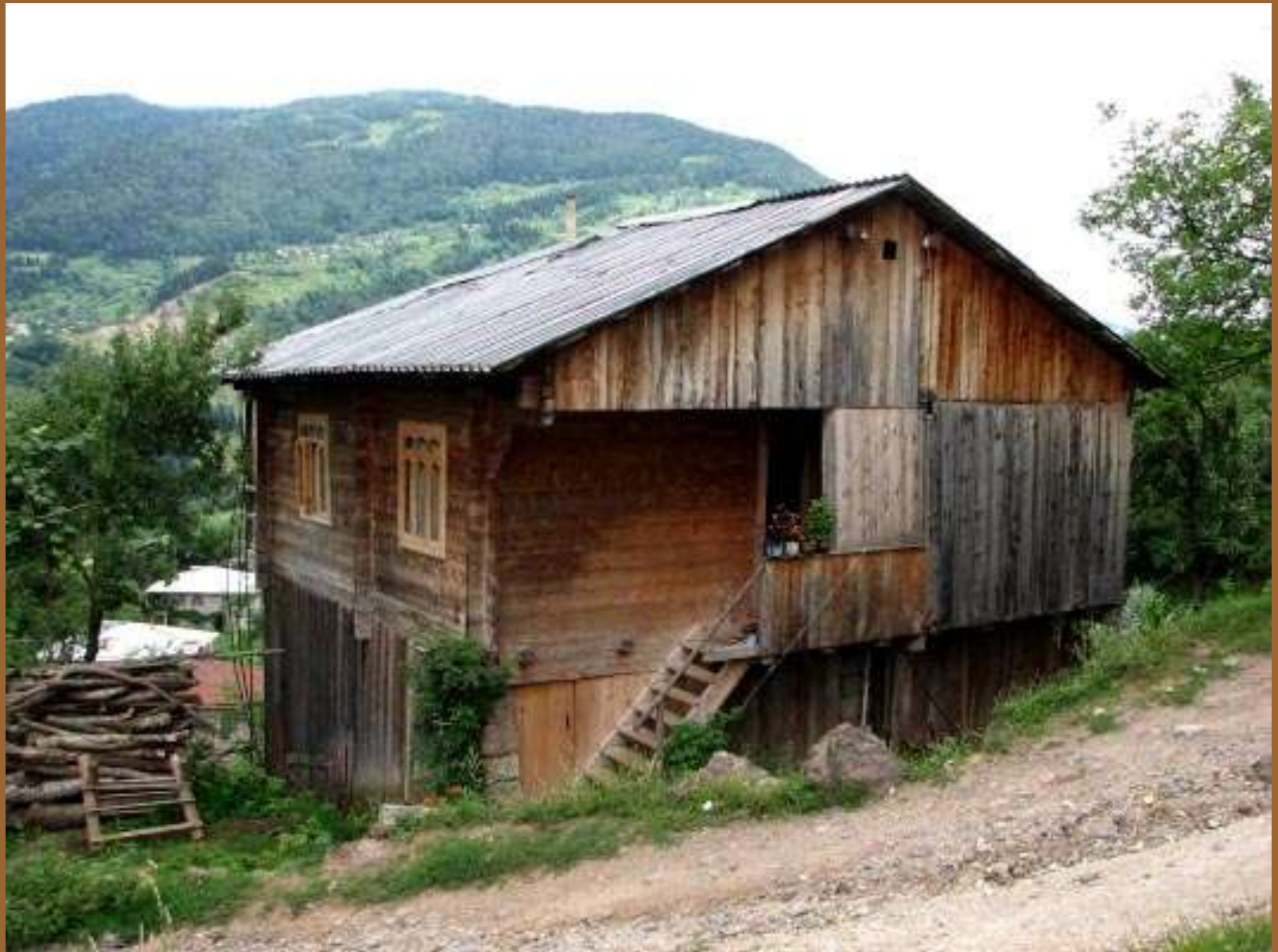
Traditional House in Didachara