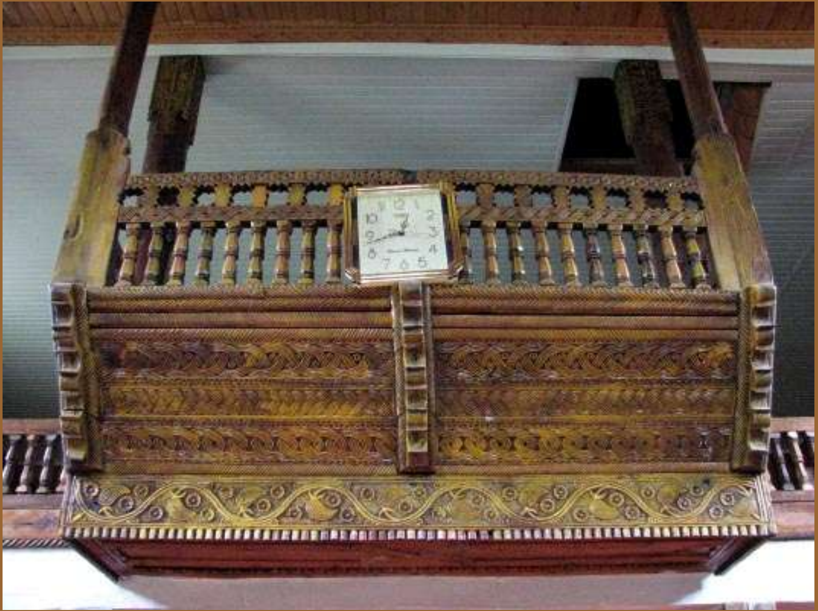
Interior Detail of the Mosque