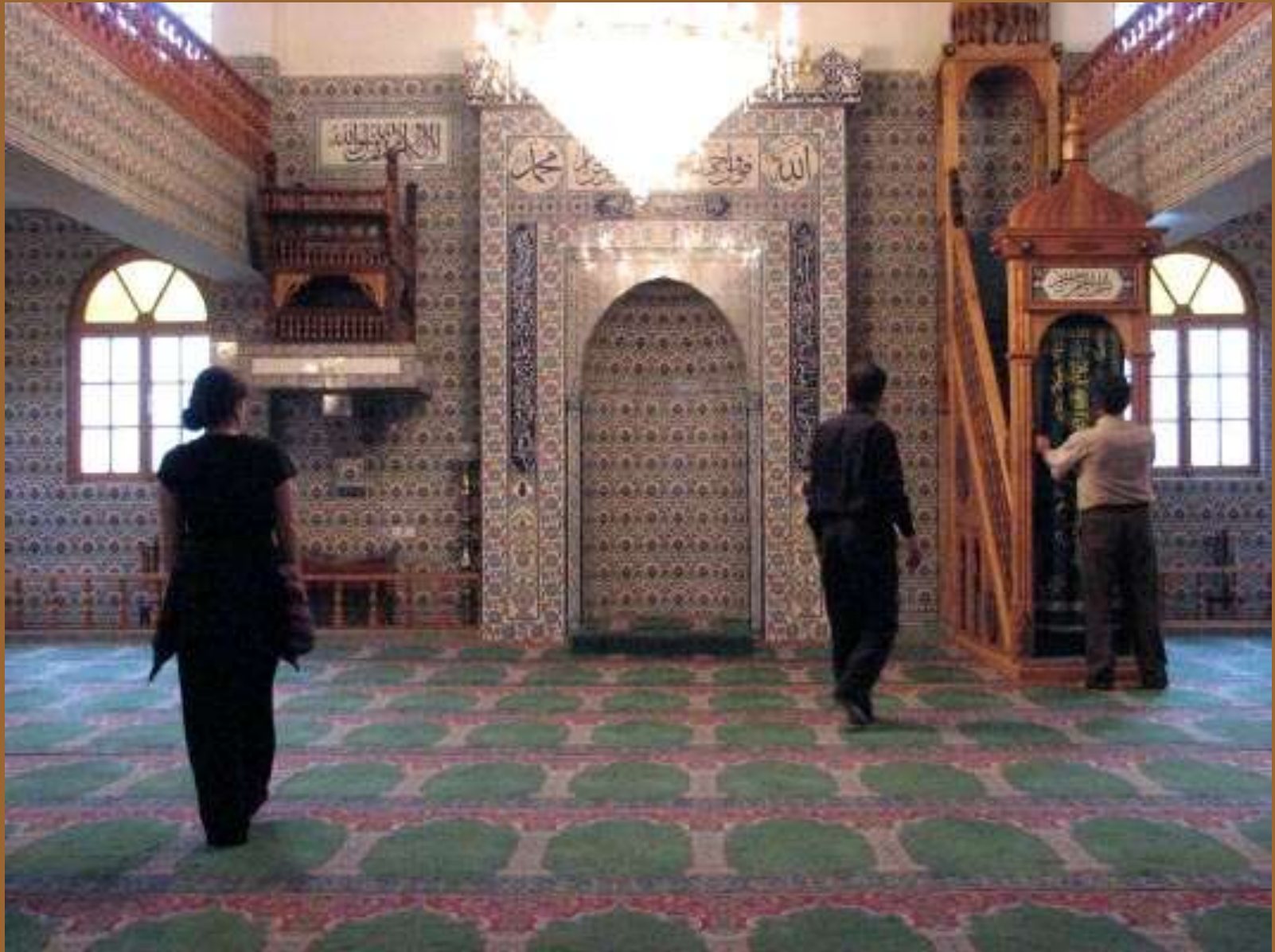
Interior of the Mosque