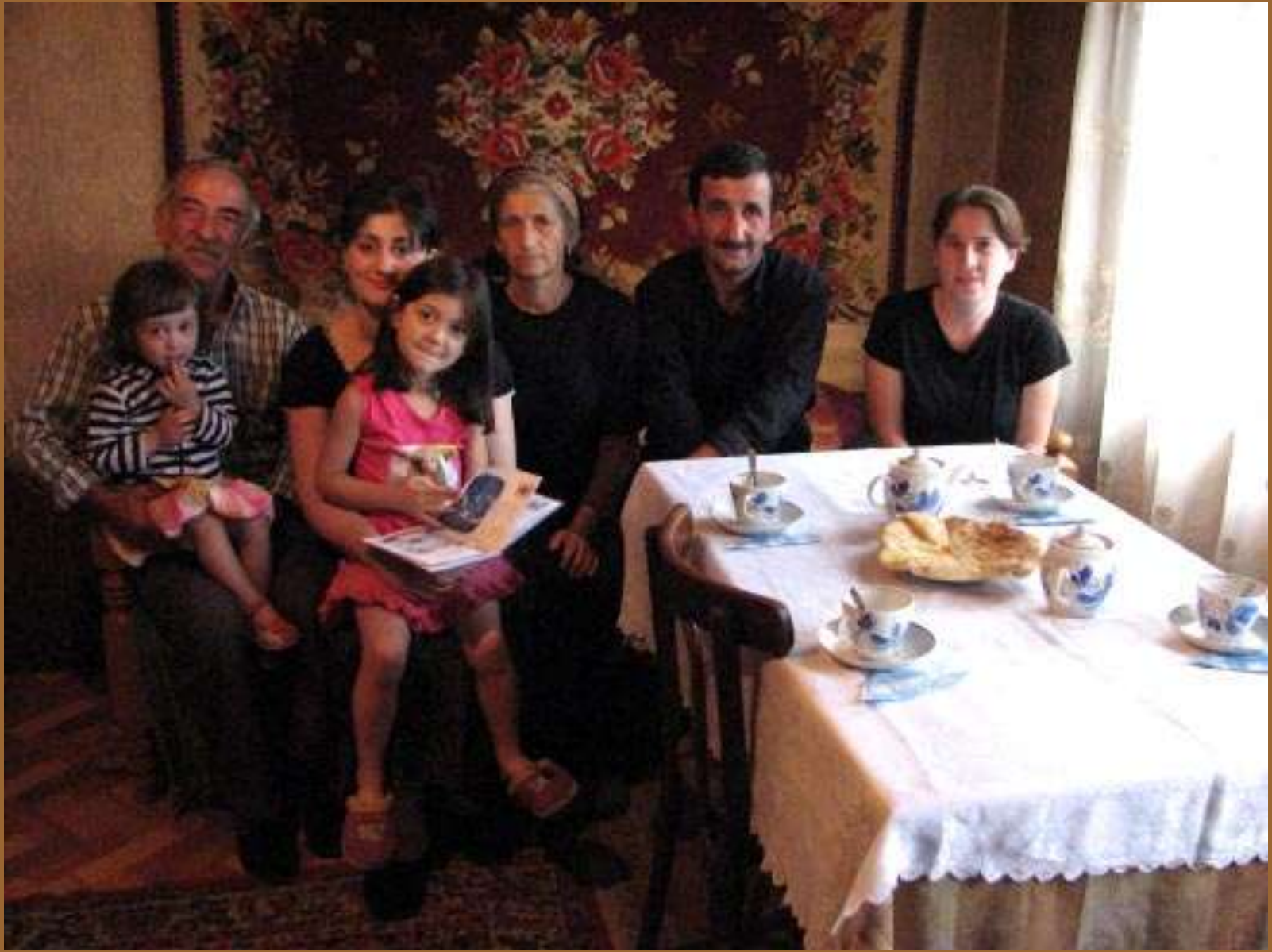
Host Family in Didachara