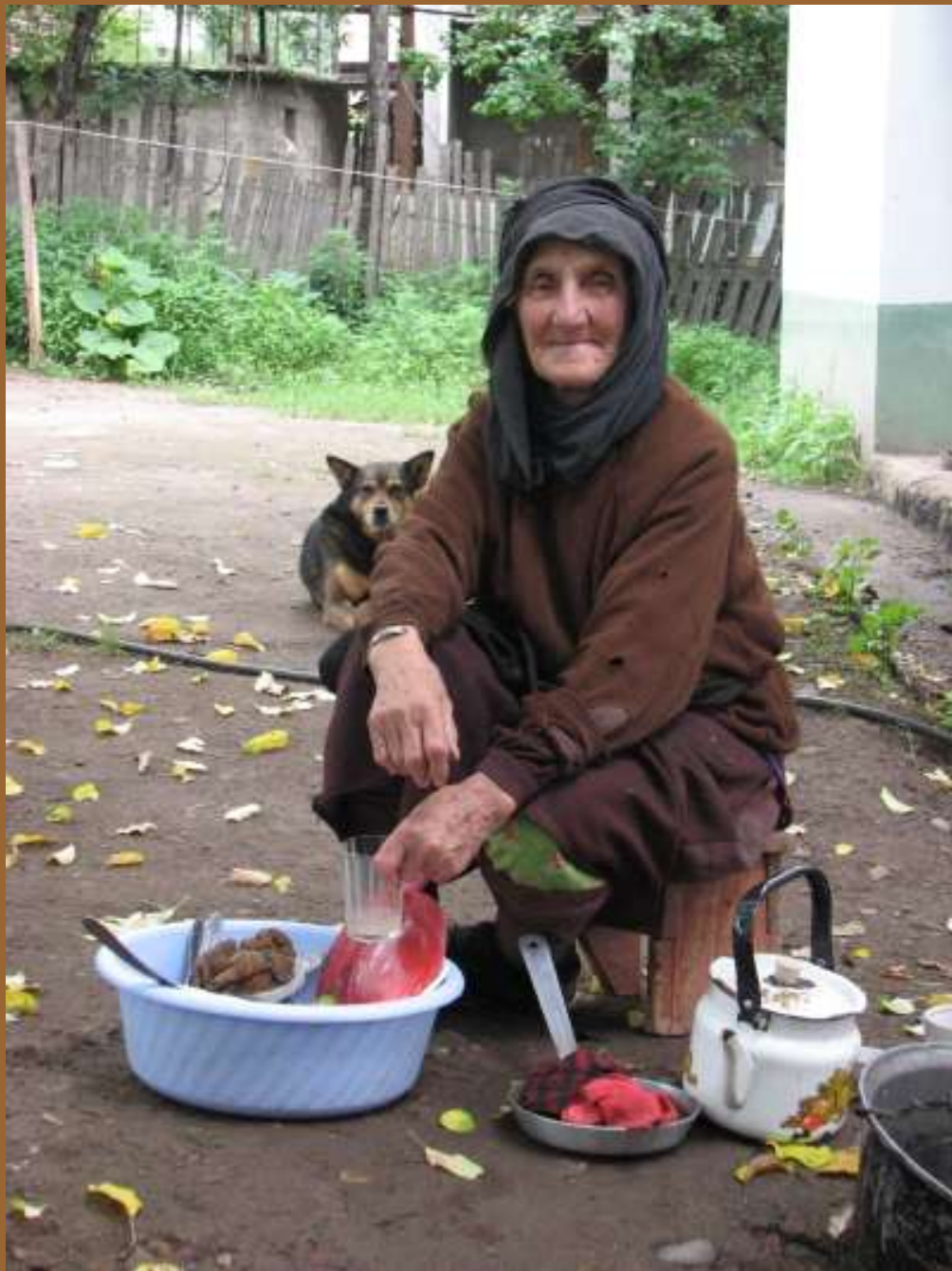
Woman from Didachara