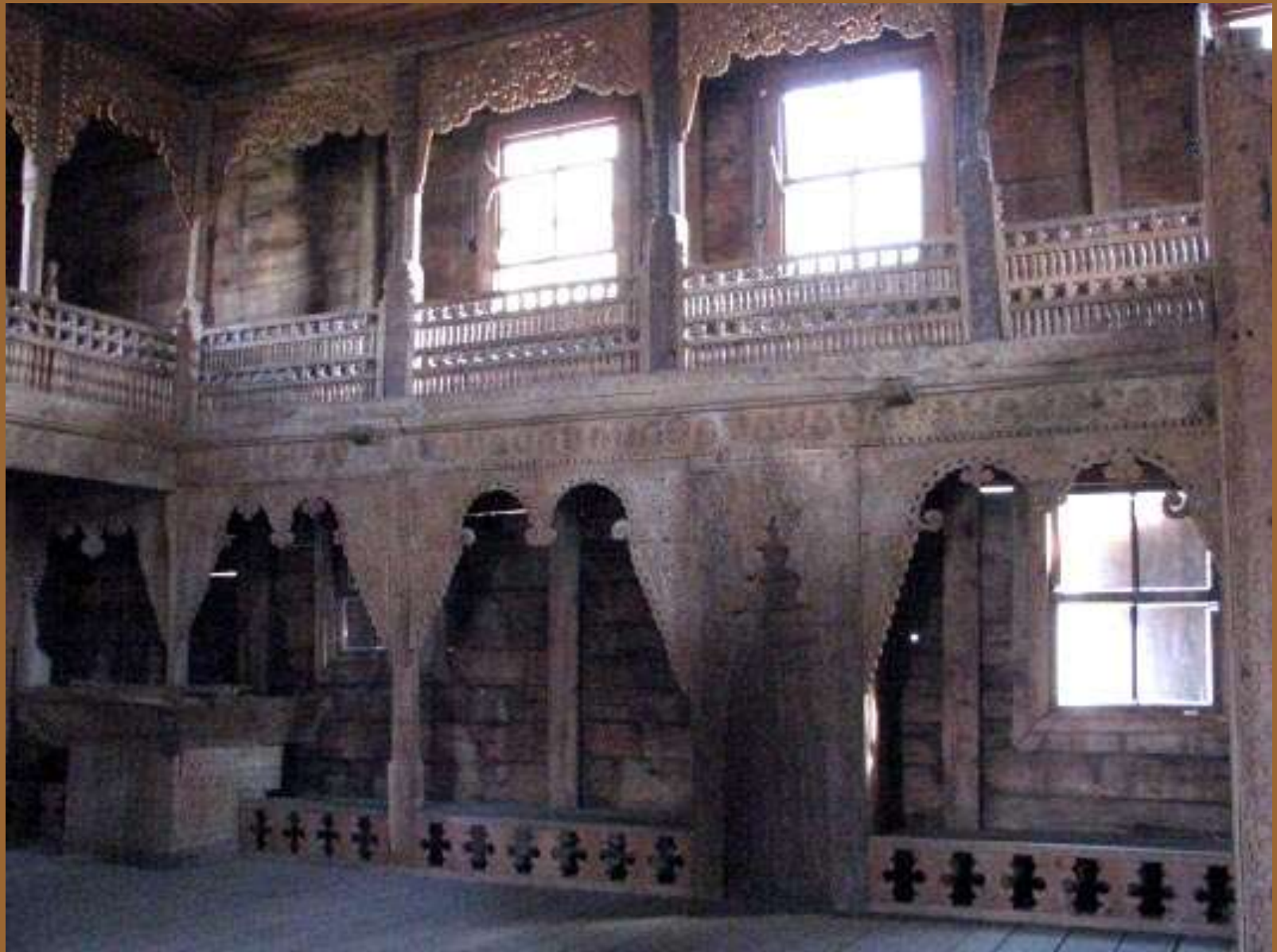
Interior of the Mosque from Chikuneti Village of the Khelvachauri District of Ajara Open Air Museum of Folk Architecture in Tbilisi, Georgia