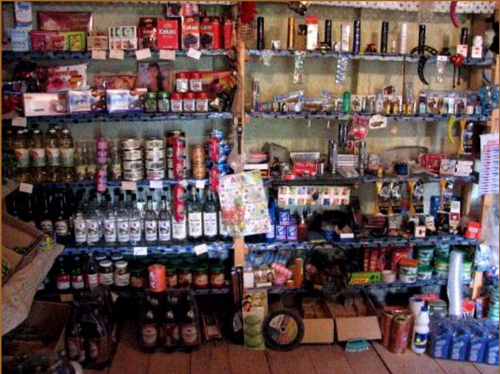
Mini-market in the Village of Didachara