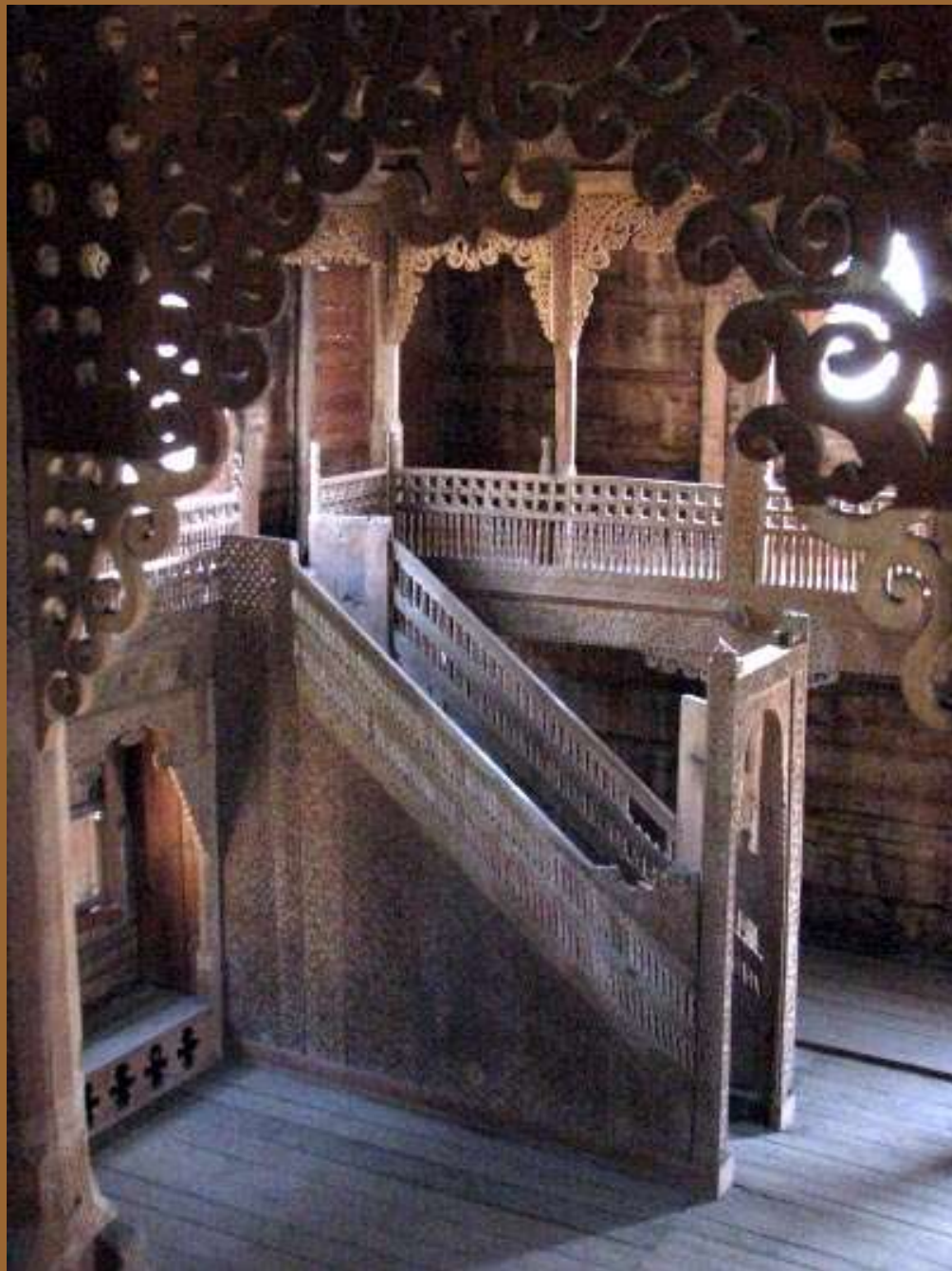
Detail of the Interior, Chikuneti Mosque