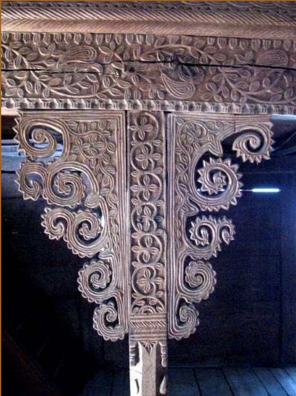
Detail of the Interior, Chikuneti Mosque