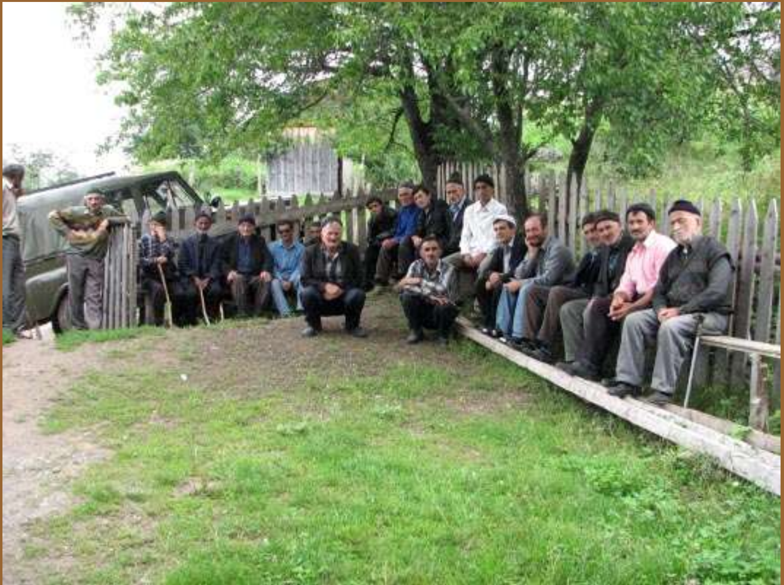
Villagers Gathered in the Yard of the Mosque at the Iremadzeebi Village