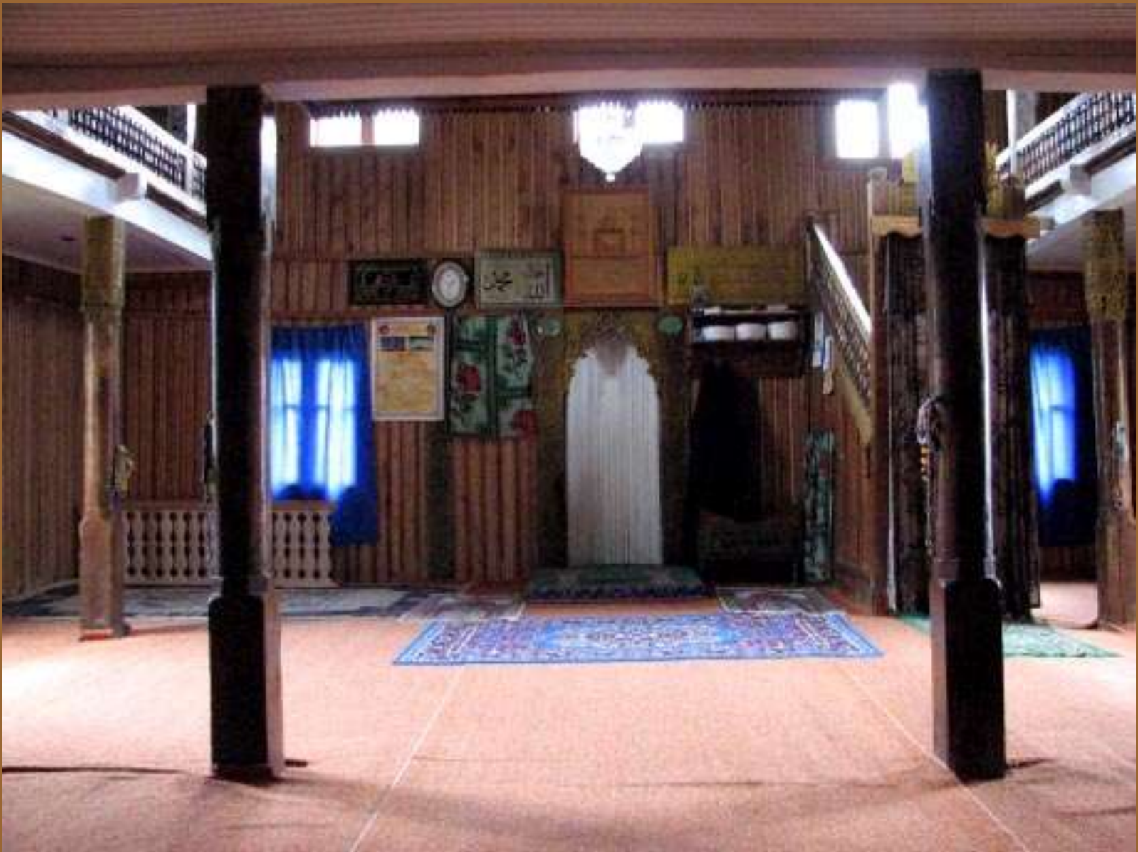
Interior of the Iremadzeebi Village Mosque