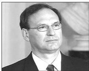
Samuel Alito Jr.

The conspiracy theorists will say that Bush nominated her only as a smokescreen to push in