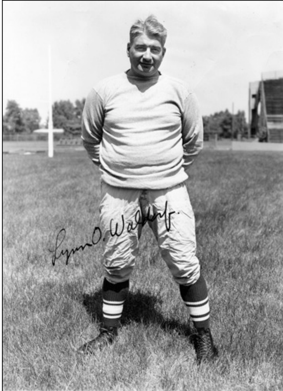
Coach Lynn O. "Pappy" Waldorf Football Coach at Northwestern University Circa 1942