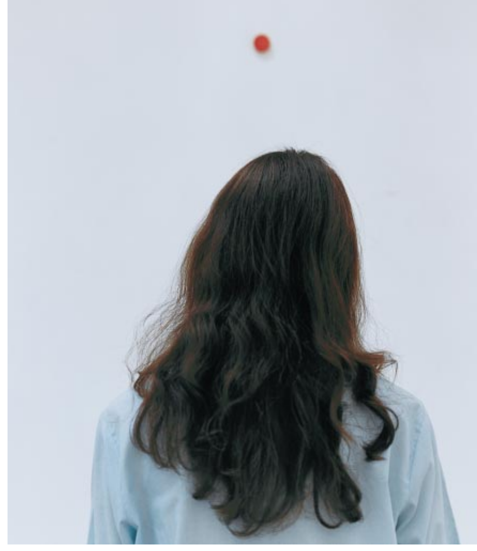
IT DOESN'T TAKE MUCH to induce hypnosis: staring fixedly at a spot on the wall and listening to the soothing voice of a hypnotist will do the trick for most people.

Many researchers now believe that these types of disconnections are at the heart of hypnosis. In response to suggestion, subjects make movements without conscious intent, fail to detect exceedingly painful stimulation or temporarily forget a familiar fact. Of course, these kinds of things also happen outside hypnosis—