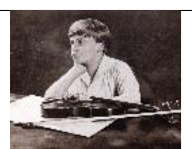
Figure 2. A prodigy being called to the stage, or a boy wishing he were outside playing baseball? Actually, a photograph of the 20<sup>th</sup>-century violin virituoso Yehudi Menuhin, age 12 (<u>in the public domain; image scanned from an original photograph by Samuel Lumiere in the National Library of France</u>). Another portrait from this series, redrawn by Christiana Morgan, served as the basis for Card 1 of the TAT (Jahnke & Morgan, 1997).

subjects are asked to generate a story in response to a picture selected to tap internal motives, such as the needs for achievement ( n Ach;) (D.C. McClelland et al., 1953), power ( n Pow;) (Winter, 1973), and affiliation or intimacy ( n Int;) (McAdams, 1989). The stories are then coded with an empirically derived content-analysis scheme to yield an assessment of the individual's standing on the motive in question (Pang, 2010; Schultheiss & Pang, 2007; Schultheiss & Schultheiss, 2014). But nowhere are subjects asked to introspect, or report, on their motives as such.