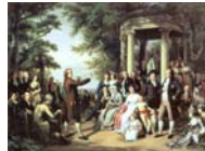
Theatrbild von Oer The Weimar Courtyard of the Museum (1860)