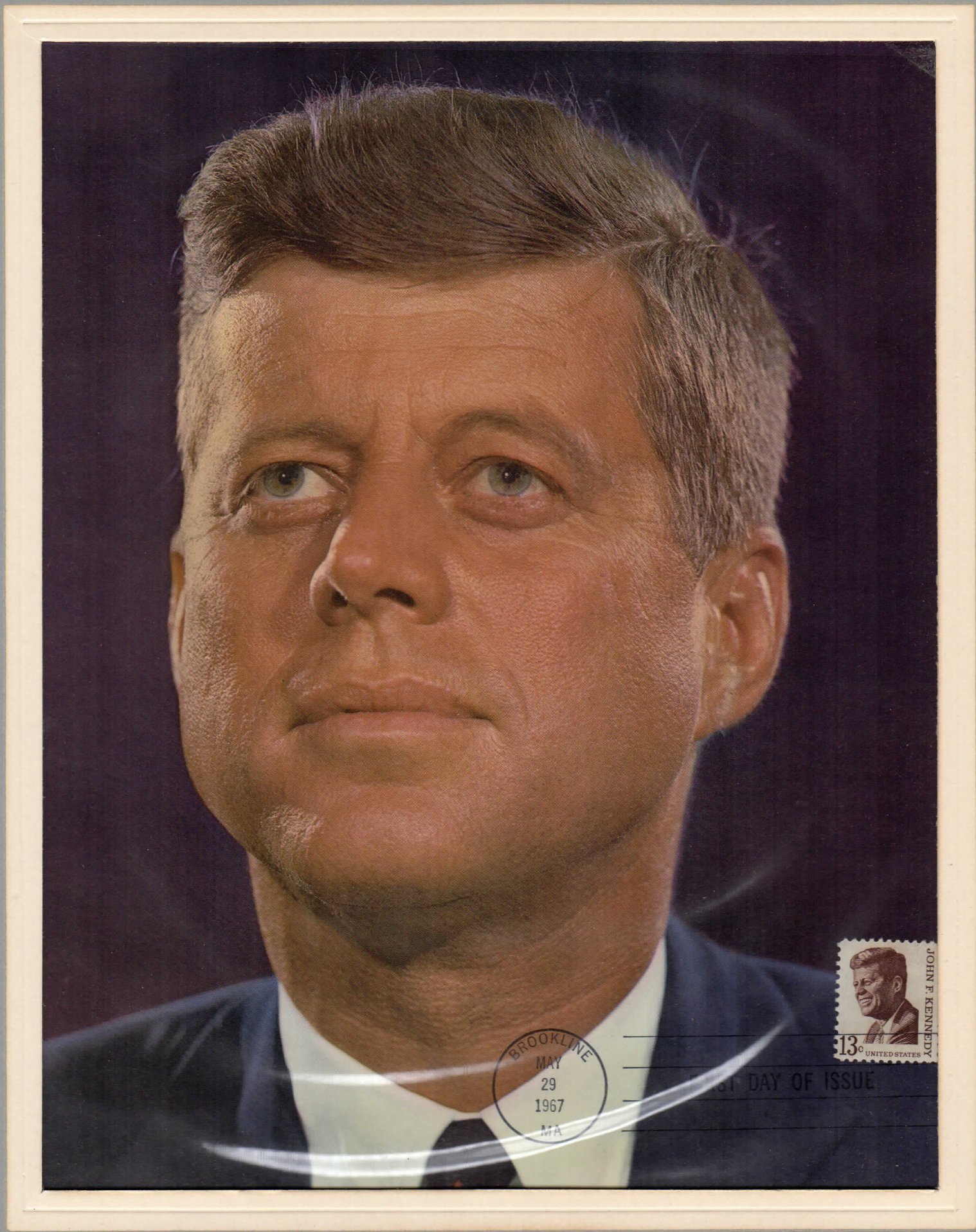
The design is by Stevan Dohanos; the portrait based on a photograph by Jacques Lowe, which appeared in "The Kennedy Years," compiled by the editors of The New York Times and The Viking Press.