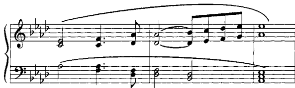
Example 1d. "Grail" motive in Wagner's Parsifal .