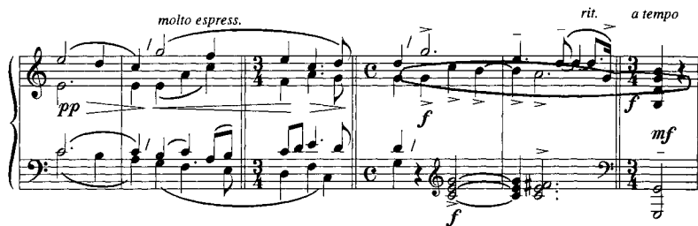
Example 1f. Version "e" of the motive at the final "Amen" of the Service (rehearsal number 95).