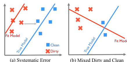
Figure 1: (a) Systematic corruption in one variable (axes) can lead to a shifted model (fitted lines). (b) Mixed dirty and clean data results in a less accurate model than no cleaning.

To highlight the importance of data cleaning in modern ML pipelines, we have noted the choice of data cleaning algorithm can