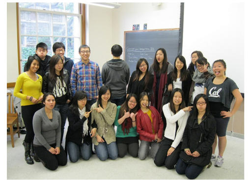
Spring 2012 Workshop #2

Welcome back to Berkeley! Hope everyone had fun during spring break and got a lot of rest. Here is a friendly reminder that there will be another workshop this Sunday, April 8. There will be an alumni panel and some healthcare discussion during this workshop, and you will have the chance to meet up with VHIO friends. Also, we are excited to announce that the end-of-the-year banquet is coming up on April 27, so do RSVP as soon as possible! It would be a lot of fun to eat delicious food, dress up, and hang out with the VHIO family! We are looking forward to seeing all of you there! :)